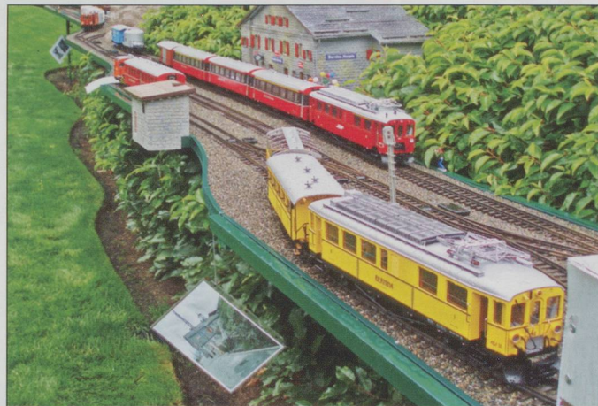
ABOVE: Train activity at Ospizio Bernia. This photo was taken at the time of the National Garden Railway Convention in August 2010.