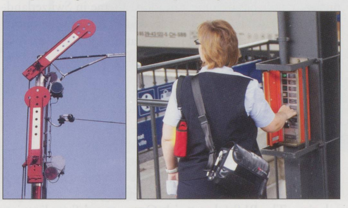
ABOVE LEFT: A Semaphore Signal at Seetal.

to gain or lose time in section to facilitate the smooth operation of stations and train crossings. It has been a tour-de-force to convert the Swiss system, with its hand-thrown unlocked points and crossings, treadle-operated semaphores, open-air lever frames, and elderly block systems of 40-years ago, to a high speed network for tomorrow. Just at one or two places, like Filisur, and Bauma, you can still hear the ding-dong of the old bell. But it's nostalgia; they don't really feature in the rule book any more. Many bells, and semaphore signals, are now in private gardens.