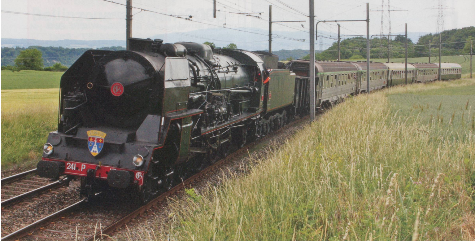
SNCF 4-8-2- 'Mountain' 241P17 with a special formed of French rolling stock on Swiss territory at Satigny (GE).

Gordon Wiseman takes a historic and current look at the transport infrastructure of this City State