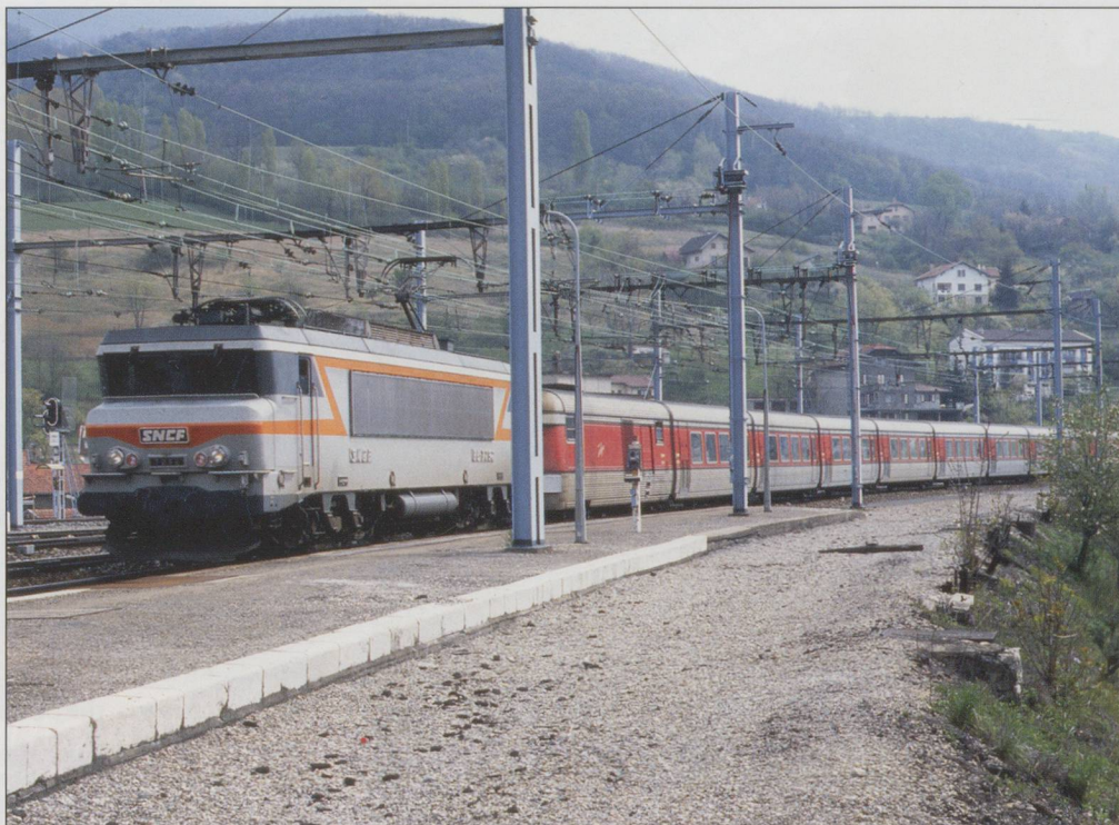
Erstwhile TEE/EC Catalan Talgo Genève – Barcelona train at Bellegarde in the mid-1980s.

The line was electrified in 1956 at 1500V d.c. as an extension to SNCF's main line electrification programme and to operate the La Plaine local services SBB/CFF bought two non-standard two-car EMUs sets BDe4/4 1301 -1302. The local service (now extended to Bellegarde) is currently operated by six 1500V d.c. Class 550 Bem 4/6 articulated units (these have auxiliary diesel engines for trips to/from their dépôt) supplemented by Class RABe 524 dual-voltage FLIRTs recently moved from the Ticino. The unique tri-current Ae4/6III 10851 (rebuilt from gas turbine Am4/6 1101 in 1959) was also allocated to Genève at one time to cater for the different electrification systems. Over the years the line has seen all the main SNCF d.c. electric classes, including record breakers such as CC7100 class member 7107. Reflecting SNCF traction policy, use of bi-current locomotives has increased gradually. Due to the route to Grenoble not being fully electrified diesel traction has also used the line; from "Picasso" railcars in the 1950s; through the well-loved big CC72000 C-Cs; to today's next-generation bi-mode AGC units. Rolling stock variety has included Swiss