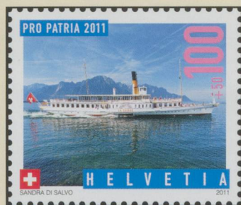
Stamp illustrations