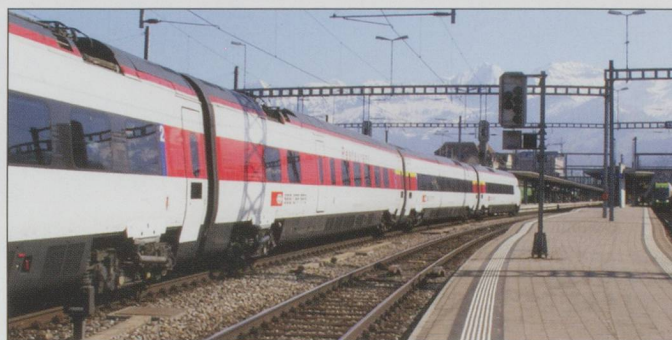
ABOVE: SBB 610 001 "Pendolino" for Milano.

BOTTOM LEFT: BLS 486-510 and SBB 620 065 wait with freights at Spiez.