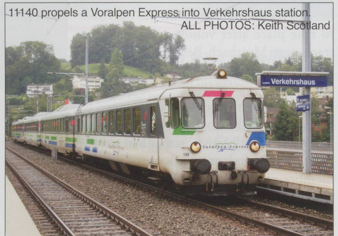
11140 propels a Voralpen Express into Verkehrshaus station.