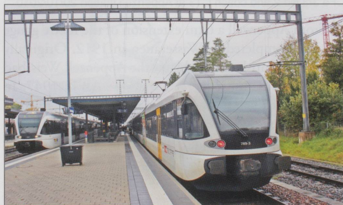
Thurbo RABe No.526 789-3 to Schaffhausen at Kreuzlingen (with No.526 790-1 to Herisau on its left) 16/10/2010.

From St Gallen to Herisau Südostbahn (SOB), trains run along what was formerly part of the Bodensee-Toggenburg-Bahn (BT) and over the Sitter viaduct. Opened in 1910, this is 99m above the floor of the river valley and is one of the tallest railway bridges in Switzerland. Many of the local services in the St Gallen area are now operated by Turbo electrical multiple units of the class RABe 526.7 with their extremely colourful and modern interiors.