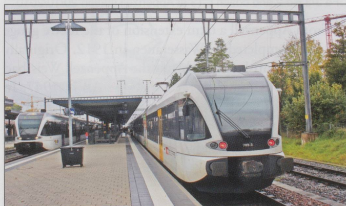
Thurbo RABe No.526 789-3 to Schaffhausen at Kreuzlingen (with No.526 790-1 to Herisau on its left) 16/10/2010.

From St Gallen to Herisau Südostbahn (SOB), trains run along what was formerly part of the Bodensee-Toggenburg-Bahn (BT) and over the Sitter viaduct. Opened in 1910, this is 99m above the floor of the river valley and is one of the tallest railway bridges in Switzerland. Many of the local services in the St Gallen area are now operated by Turbo electrical multiple units of the class RABe 526.7 with their extremely colourful and modern interiors.