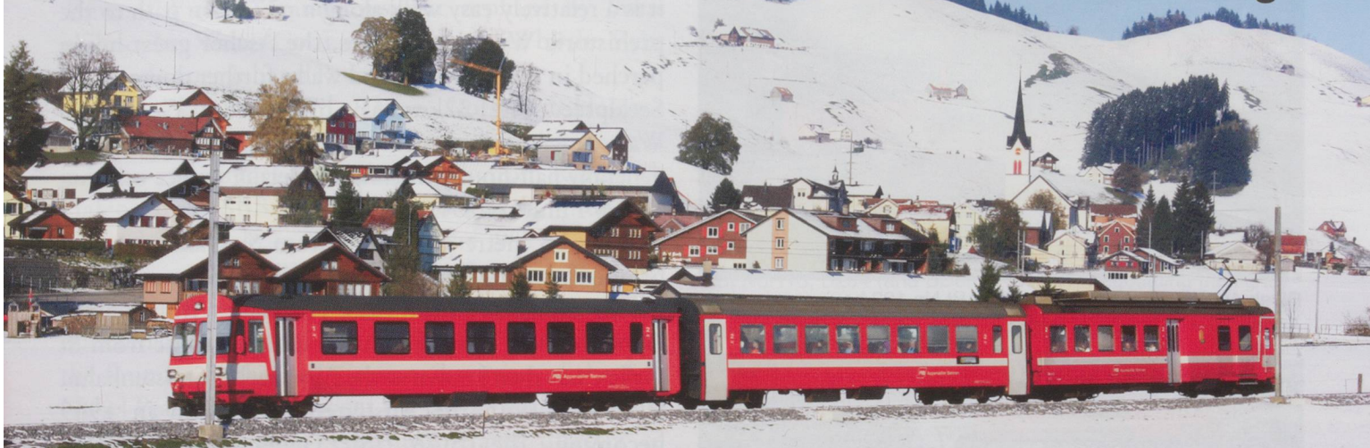
ABT No.143, B248 and BDe 4/4 No.43 travelling west from Gonten after recent snowfall with the 15.40 to Gossau on 26/10/ 2010.