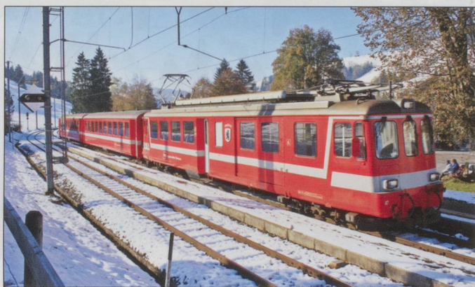
BDe 4/4 No.47, B244 and ABt No.146 arriving at Jakobsbad after fresh snowfall with the 14.47 Gossau – Wasserauen on 26/10/2010.