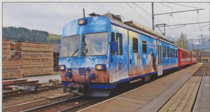
BDe 4/4 No.44 in OSTWIND blue, B246 and ABt No.144 arriving at Gonten for the 16.47 departure to Wasserauen on 19/10/2010.

Be 4/8 No.34 waiting to depart with the 17.02 Trogen – St Gallen on 24/10/2010.