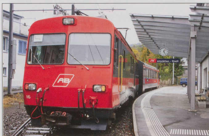
ABt No.116 and BDeh 4/4 No.16 waiting to take the 1228 from Altstätten Stadt to Gais on 24/10/2010.