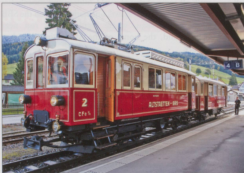
CFe 3/3 No.2 and coach C13 at Appenzell station 20/10/2010.

From Appenzell a 6km extension of the metre gauge line was completed to Wasserauen in 1912. Originally called the Säntisbahn, and later the Appenzell Weissbad Wasserauen Bahn, it merged with the AB in 1947. In the late 19thC various projects were considered for a railway from Wasserauen to the top of Mt Säntis although all fell through. Eventually Mt Säntis was reached in 1935 by the spectacular cable car from Schwägalp. Excursions include:- the PostAuto from Weissbad to Brülisau for the cable car to Hoher Kasten