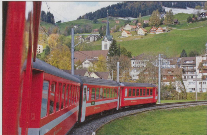
ABt No.141, B247, B236 and BDe 4/4 No.41 with the 10.33 Appenzell – Gossau on the tight curve approaching Urnäsch on 21/10/2010.

BDeh 3/6 No.25 at Rorschach Hafen having arrived at 15.28 from Heiden on 23/10/2010.