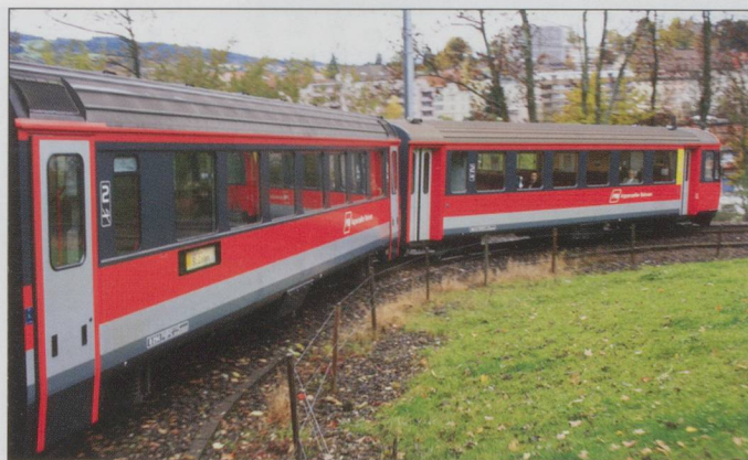
ABt No.113, B294 (and BDeh 4/4 No.11) negotiating the tightly curved approach to St Gallen on the rack section from Riethüsi with the 12.38 from Appenzell on 24/10/2010.