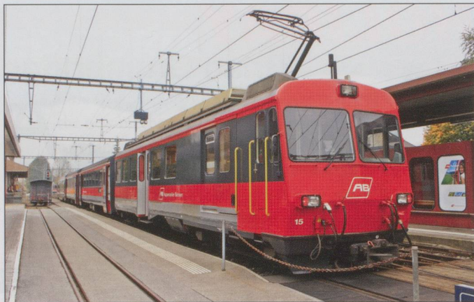
BDeh 4/4 No.15, B292, B291 and ABt No.123 having arrived at Appenzell with the 09:37 from St Gallen on 15/10/ 2010.