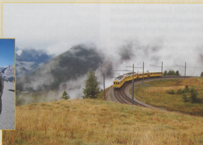
Disappointingly dismal weather at Alp Grum on the first day (Saturday)