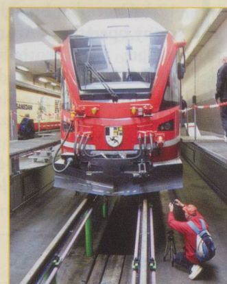
Getting down to it! Yet another photograph is taken of an Allegra (in Pontresina depot)