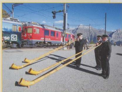
An alpenhorn group playing while a train halts at Alp Grum on the second day in very different conditions from the first day.