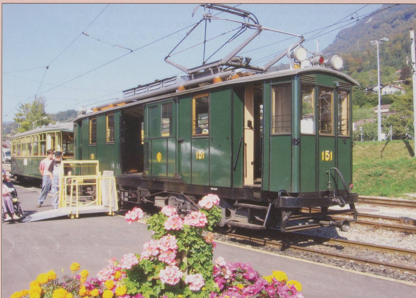
CGTE Fe 4/4 151 (1910) at Blonay on 29/9/09. This tram will be celebrating its centenary this year.