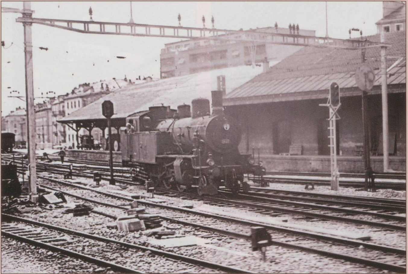
Can anyone name the location and class of this locomotive?