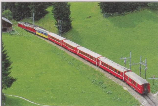
The traditional view from Poststrasse of a train beginning the long descent to Chur.