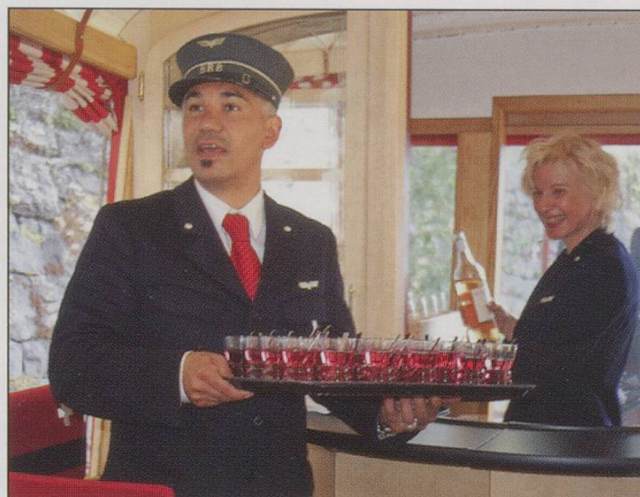
On board the Salon Rouge.

Joy's gear disappeared in Britain as the need to drill holes in connecting rods, just where they were most stressed, made it unsuitable for more modern designs but the last Super D, No.49395, is still running on the North York Moors showing what it was like. Of course, on BR, finding someone who still knew how to set it was difficult, as the unusual roaring and gasping of BR's