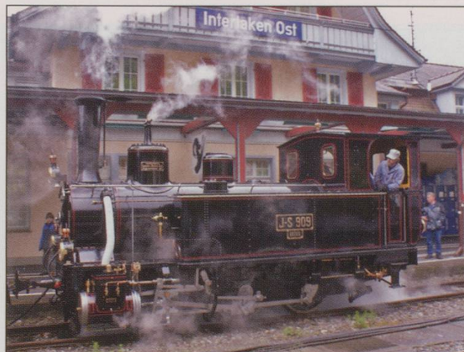
Jura-Simplon G3/3 No 909, which was built for the Brünigbahn, is now on the Blonay-Chamby.

On Sunday the process was reversed; more crowds, more food and drink, the band and the speeches, followed by the engines and trains leaving for their home depots. I am told that the sun came out briefly, but my big dog and I weren't there to see it, although it was obviously another great day.