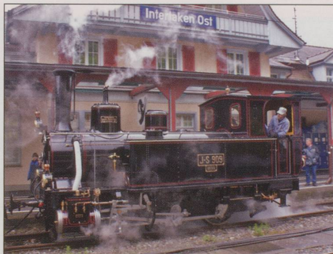
Jura-Simplon G3/3 No 909, which was built for the Brünigbahn, is now on the Blonay-Chamby.

On Sunday the process was reversed; more crowds, more food and drink, the band and the speeches, followed by the engines and trains leaving for their home depots. I am told that the sun came out briefly, but my big dog and I weren't there to see it, although it was obviously another great day.