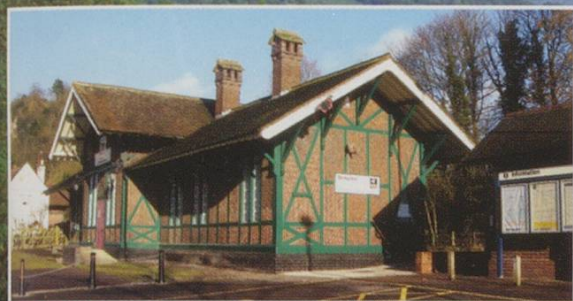
Matlock sunshine.