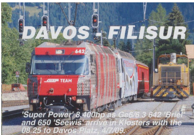
'Super Power' 8,400hp as Ge6/6 3 642 'Briel' and 650 'Seewis' arrive in Klosters with the 08.25 to Davos Platz, 4/7/09.