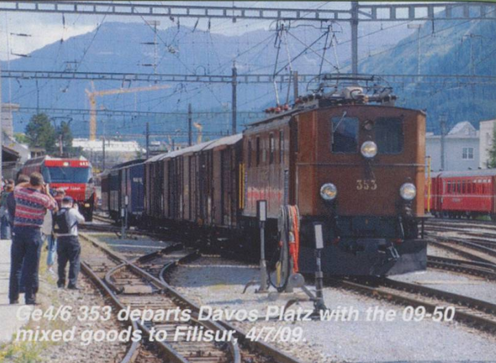
Ge4/6 353 departs Davos Platz with the 09-50 mixed goods to Filisur, 4/7/09.

The Jubilaeumfest to celebrate the 100th anniversary of the RhB's Davos to Filisur occurred over the weekend of June 4th and 5th 2009. Thanks to the STO website I was able to arrange a competitive package in the Davos 'Hotel Sport' that had the advantage of having a free Railover ticket for all journeys between Klosters and Filisur as well as all mountain transport in the Davos/ Klosters area.