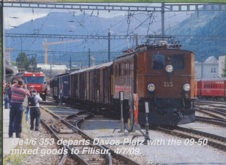
Ge4/6 353 departs Davos Platz with the 09-50 mixed goods to Filisur, 4/7/09.

The Jubilaefest to celebrate the 100th anniversary of the RhB's Davos to Filisur occurred over the weekend of June 4th and 5th 2009. Thanks to the STO website I was able to arrange a competitive package in the Davos 'Hotel Sport' that had the advantage of having a free Railrover ticket for all journeys between Klosters and Filisur as well as all mountain transport in the Davos/Klosters area.