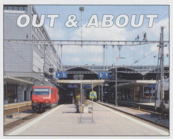
A Sunny Day at Luzern HBf.