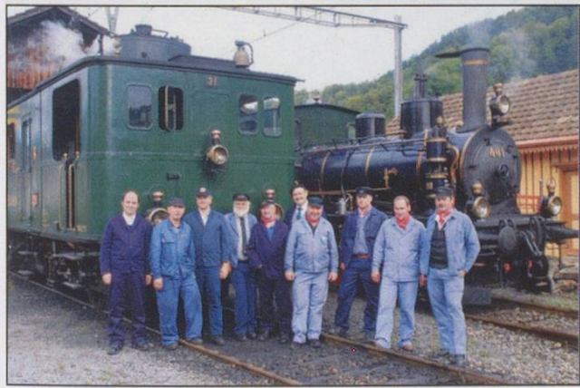
The four GWS members pose with their Swiss compatriots, the visitors being 1st 2nd 4th & 5th from the left.