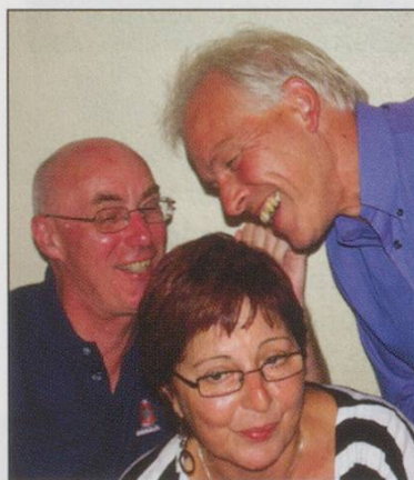
The final evening together. Good, healthy complexions all round.