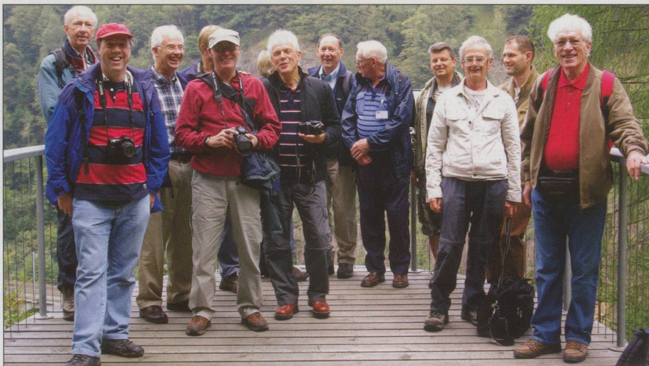
The walking group on the Saturday, posed on the viewing platform above the Secken viaduct.