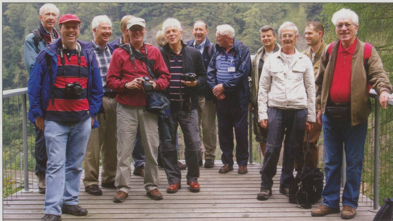
The walking group on the Saturday, posed on the viewing platform above the Secken viaduct.