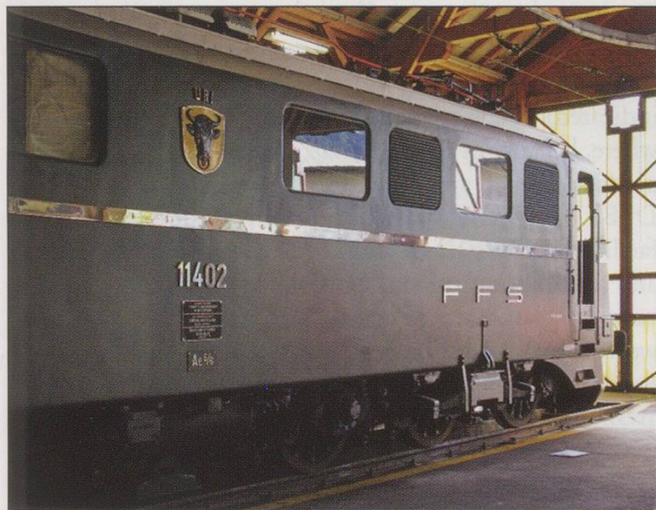
One of Erstfeld's historic locos, 11402 "Uri" slumbers in the dépôt.

and they operated both HO and HOm trains in a pretty crowded building, as most of our group were present. Friday morning started with a visit to Erstfeld Depot, where we split into three groups, each conducted around by an English-speaking driver. The historic SBB items, of which Erstfeld now has a large collection, were of most interest. We were able to board most of these and observe the marked differences between the older and newer locomotives.