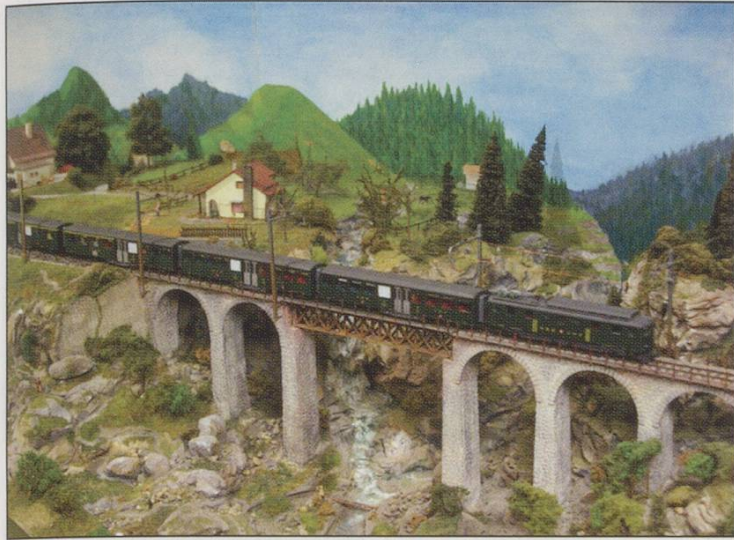
A scene on the HOm layout of the Luzern club, EMBL.

and they operated both HO and HOm trains in a pretty crowded building, as most of our group were present. Friday morning started with a visit to Erstfeld Depot, where we split into three groups, each conducted around by an English-speaking driver. The historic SBB items, of which Erstfeld now has a large collection, were of most interest. We were able to board most of these and observe the marked differences between the older and newer locomotives.