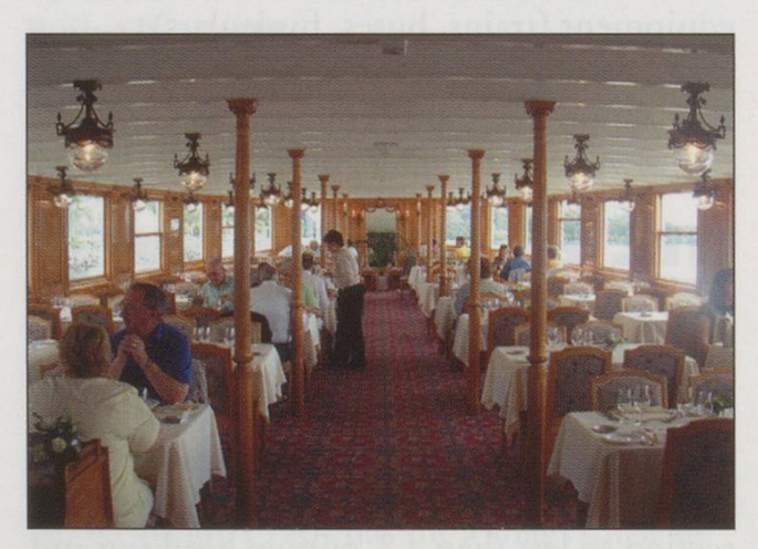
The beautifully restored first class dining room on La Suisse. 21/07/09

My childhood home was on the banks of the River Avon in Bristol and one of my earliest recollections is watching the paddle steamers of Campbell's White Funnel Fleet limp home from their wartime duties in mine-sweeping, still in their drab wartime colours. One by one, they re-emerged from dry dock with their white funnels and as I grew up trips around the Bristol Channel started an interest in paddle steamers. Later, on our very first Swiss holiday, I had the opportunity to sail on both the Vierwald-stättersee and the Brienzersee – and the memories came flooding back.