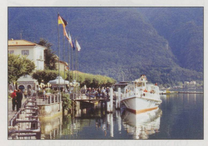
ms Milano has arrived at Porlezza on the Italian shores of Lake Lugano. 19/09.00

then doing "formation dancing" in the middle of the Vierwaldstättersee. A highlight of our holiday in 2000 was to stay in both Luzern and Lugano, using the Wilhelm Tell Express – with its ship segment - between the two resorts. On that occasion, with the weather in the south being dull and damp, we made very good