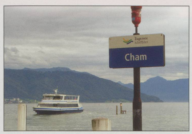
ms Schwyz passes the landing stage at Cham on Lake Zug, a much smaller operation than on Lake Luzern. 23/09/04