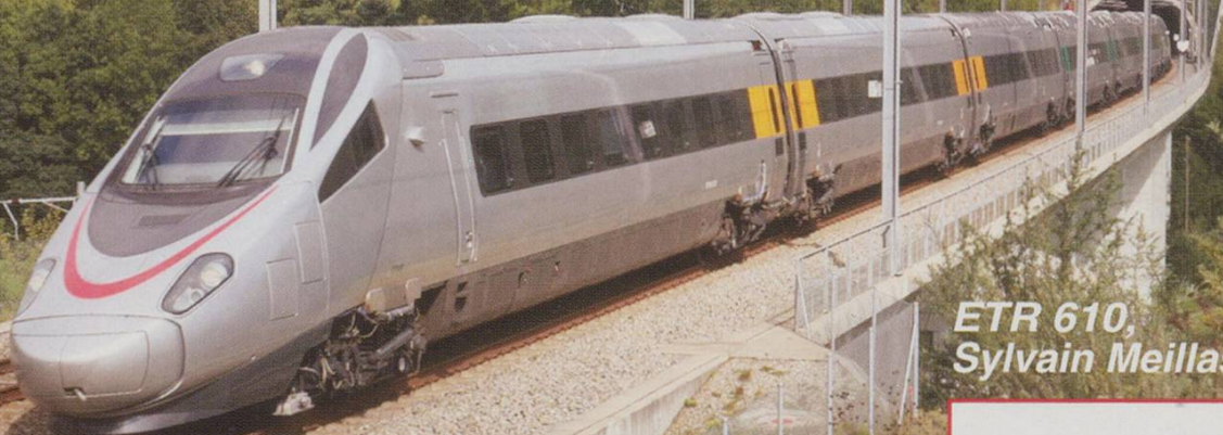
ETR 610 on test, Armin Schmutz.