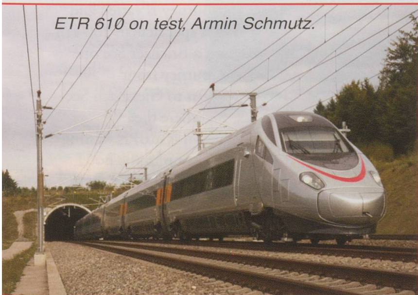
ETR 610 on test, Armin Schmutz.