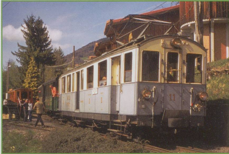
TOP RIGHT: MOB automotrice BCFE 4/4 No. 11 approaches the bifurcation at Chaulin to run onto the main line of the BC. 1 May 2008.