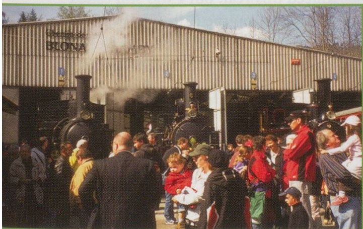
BOTTOM LEFT: A busy day at Chaulin Museum as the crowds gather to witness the synchronised whistling. 1 May 2008.