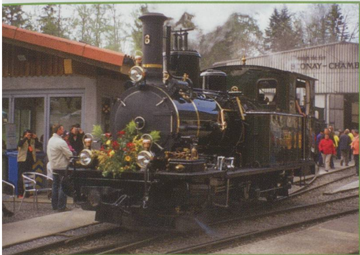
TOP LEFT: DFB HG 2/3 No. 6 "Weisshorn" runs round its train at Chaulin Museum. 1 May 2008.