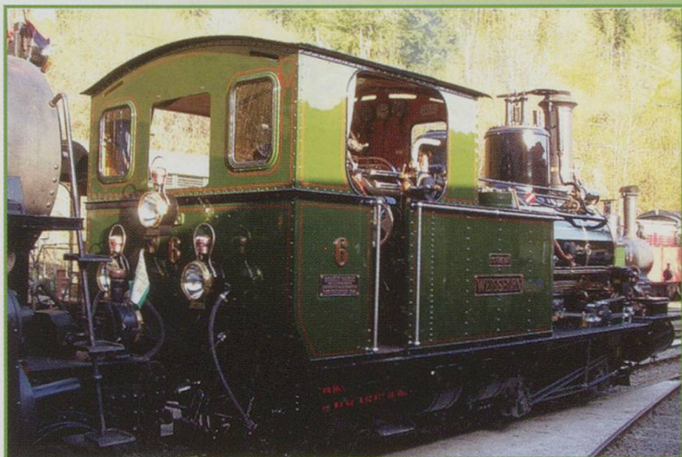
MIDDLE TOP: DFB HG2/3 No. 6 "Weisshorn" couples to sister loco BFD No. 3 for the son et lumière presentation, 3 May 2008.