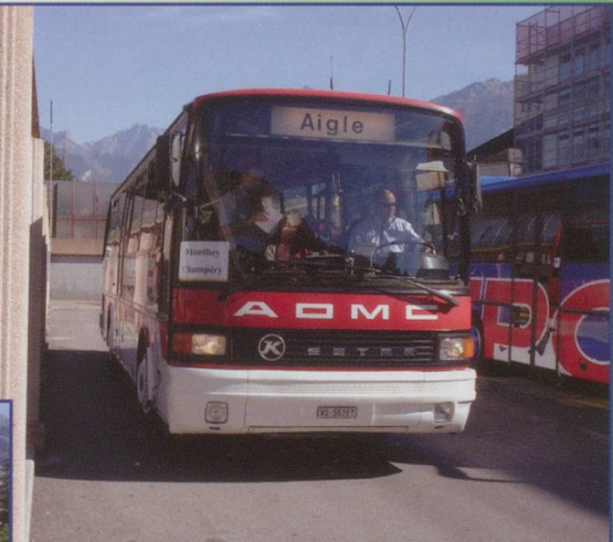
AOMC bus at Monthey Ville station on rail replacement.