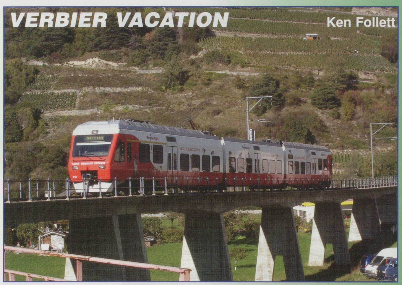
TMR(MO) low floor 'NINA' EMU RABe No.527.513 service from Le Chable on viaduct approaching Sembrancher on 10 October 2006.

The high alpine resort of Verbier is clearly not the most obvious place for a Swiss Railway buff to spend a holiday, but the offer of a friend's apartment to celebrate my 55th birthday was too good an opportunity to miss even though we would be travelling during the low season in October 2006. Verbier lies over 1000m above the Rhône valley at Martigny. We purchased our 8-day Swiss Passes for use on the trip taking advantage of the 7% discount offered at the time to members of the Swiss Railway Society. Thanks; I recovered my subscription (and more!) in one fell swoop.