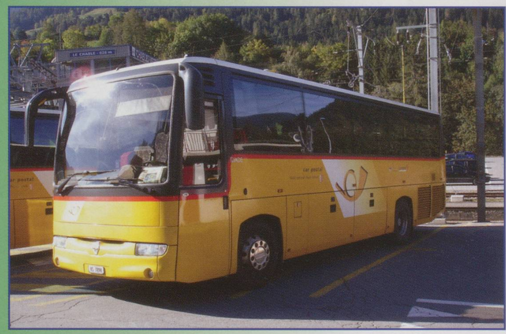
PTT bus at Le Chable (MO) station.

we got up in Kent to the time we walked through the apartment door; including 2-hours of absolute purgatory checking-in and getting through security at Luton Airport! After that the flight and all the transport connections in Switzerland went like clockwork. Anyone who has been to locations like Verbier during the low season will appreciate that many facilities are closed. The first of many encounters that