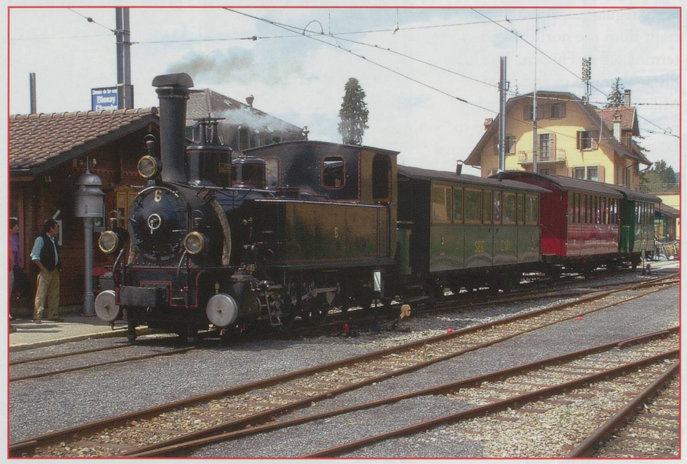
G 3/3 6 ex C de F Bière-Apples-Morges (SLM 1901, to BC 1967) waits at Blonay ready to return to Chamby, May 2006

The enthusiasts promoting the Blonay-Chamby Museum Railway (BC) were granted a concession to operate the line on 1st May 1968, less than two years after the last public train of the Chemins de fer électriques veveysans (CEV) had run. By 20th July of that year they began running their tourist trains, which have continued to attract visitors ever since. Hence the dedicated band of volunteers who operate trains every weekend from Easter to the end of October are celebrating the railway's fortieth anniversary in 2008. During this period they have been able to acquire metre gauge stock from most parts of Switzerland, as well as some from further afield, and the volunteers have built up an enviable reputation for the high standard to which their historic vehicles are restored.