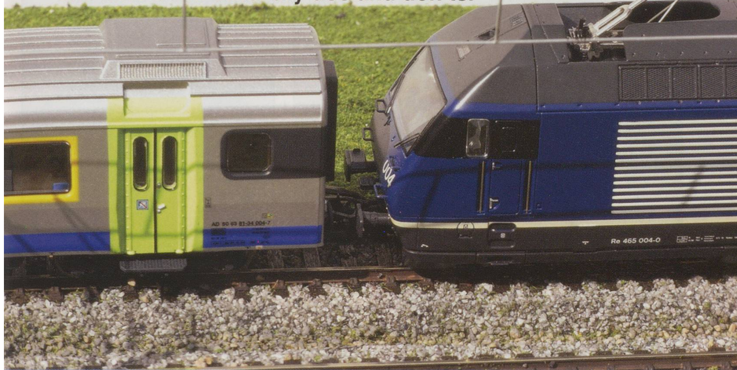
Viessmann with Roco bls class 465 loco