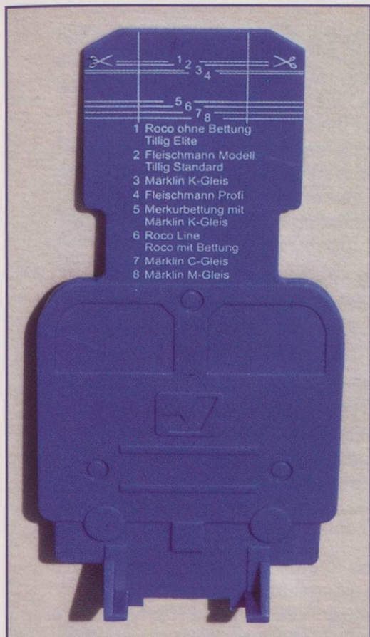
Viessmann height positioner for the wires

fixed in the correct position in relation to the pantograph of a locomotive. If the wire is too high the pantograph will not reach the wire, if it is too low the pantograph will push too much on the wire which will not make smooth operation of the trains. If the wire is too far from the centre line the