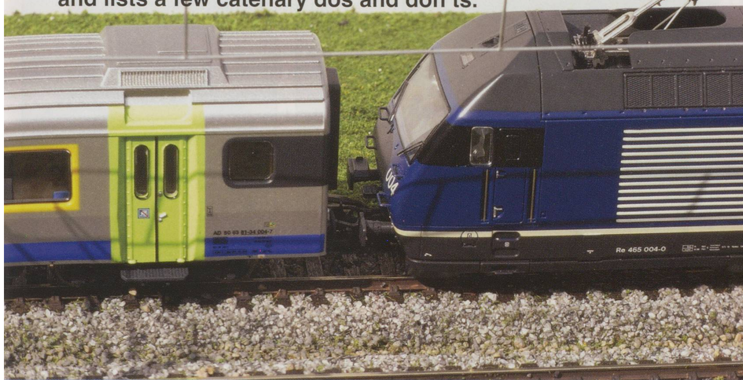
Viessmann with Roco bls class 465 loco

As one who models both UK and European layouts I can remember what a hurdle it was for me to finally get round to erecting some catenary. It took me years to stop buying just diesel locomotives and take the plunge and purchase a Swiss electric loco. I still get a little nervous when I start putting up the first mast – will it be in the right place? Will the wires meet! – I have to confess that building a stretch of catenary is one of the most satisfying aspects of current day modelling. When the wires are up you really can stand back and admire your handiwork.