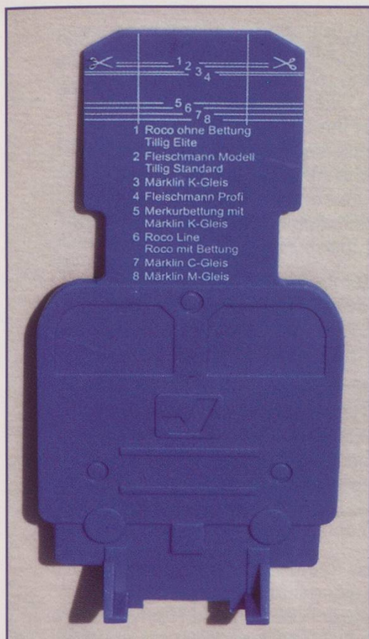
Viessmann height positioner for the wires

fixed in the correct position in relation to the pantograph of a locomotive. If the wire is too high the pantograph will not reach the wire, if it is too low the pantograph will push too much on the wire which will not make smooth operation of the trains. If the wire is too far from the centre line the