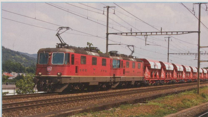
During the stop at Killwangen two Re4/4s, 11242 leading 11241 left RB Limmattal with a Holcim train at 15.18.

So what do we make of all this? It is possible to do a day trip and it can be great,