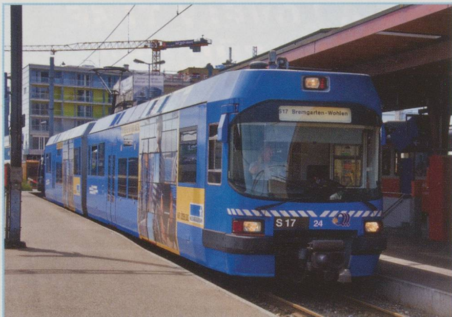
BDWM No.24 stands ready to depart from Dietikon for Wohlen. This is the train we took at 11.33.

(no socks please) and shorts. Never mind, it was sunny. We changed at Dietikon and took the metre gauge to Bremgarten West where evidence of the former standard gauge to Wohlen could be seen; I believe this is now out of use. As it was such a nice day the Three Caballeros walked back to Bremgarten Stadt, where we lunched on the platform, and then continued to Zufikon Hammergut where we caught the train back to Dietikon. We obtained some nice lineside shots on the curve halfway between the two Zufikon stations.