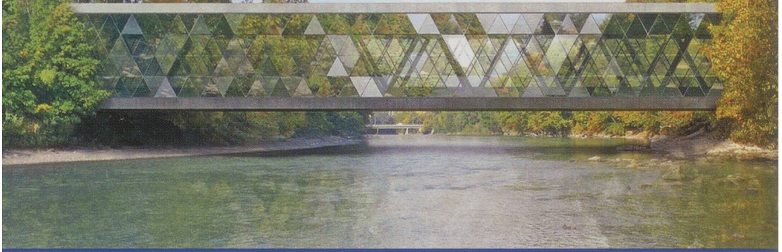
Computer impression of bridge over River Arve in Geneve.