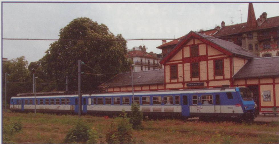
SNCF EMU 19503 waits at Genève Eaux-Vives on an Annamasse service.

Between Carouge–Bachet and Champel–Hôpital the line must cross the River Arve. Tunnelling under the river was disallowed as this would have interfered with the delicate water table under the city. The solution is an enclosed bridge reached by gradients. This metal lattice single span structure will be covered in glass triangles, these prisms reflecting light and colour. The line leading up to the bridge will have sloped landscaped ground built up to one side of the enclosed line with a pedestrian walkway on top of it. The walkways will