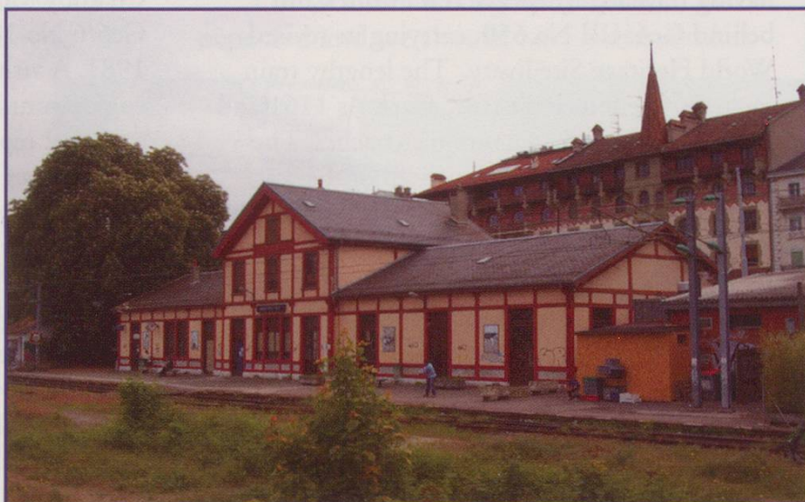
SNCF's unkempt Genève Eaux Vives Station May 2008.

The whole scheme is imaginative and bold. By using existing dilapidated infrastructure, and placing most of it underground, many new journey opportunities will be created. All these rail developments will cater well with the expected growth in passenger demand by 2020, and leave capacity for growth beyond that. More details are available at www.ceva.ch .