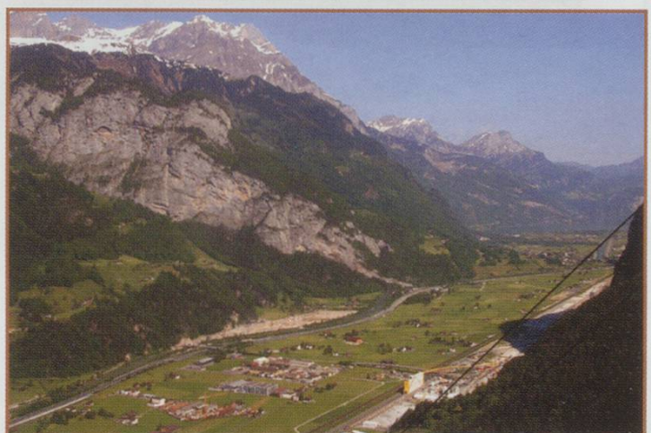
ABOVE: View from cable car north towards Vierwaldstattersee in the right distance. The keen sighted may spot 843074 on a stone train in the "NEAT" sidings between Erstfeld and Altdorf, centre bottom of the picture.