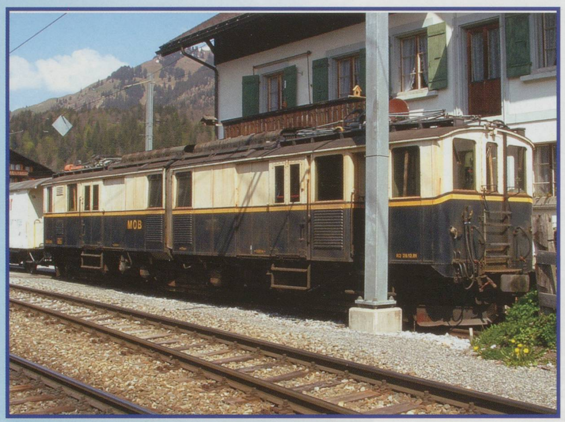
MOB DZe6/6 2002 stands in its siding at Saanen awaiting rescue by the Electric Traction group of the Blonay-Chamby Museum Railway. 7 May 2008.

On 11th July 2002 was moved from Saanen to Chernex works where a missing worksplate and lamp were to be refitted prior to delivery to the Blonay-Chamby Museum on 19th July, a significant date since it marked exactly 40 years since the first train ran on the museum line. It was planned that 2002 would arrive on the line hauled by Gde4/4 6002 and around midday