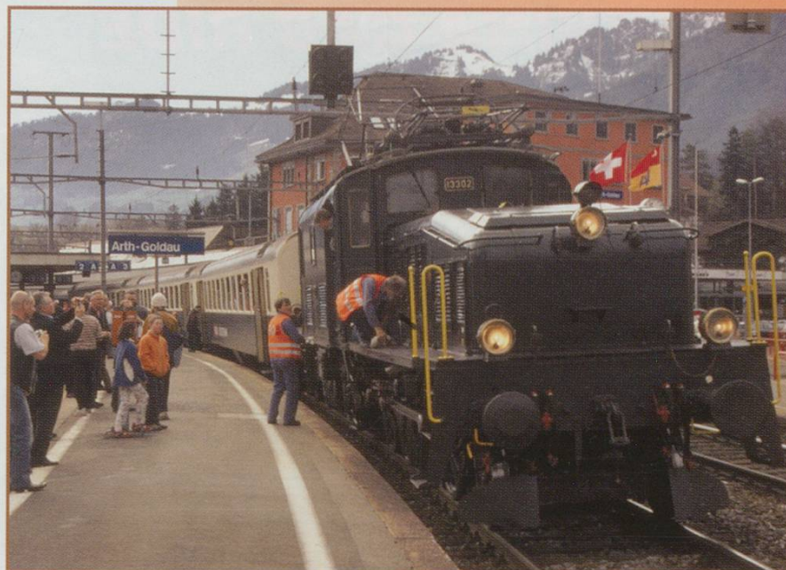
TOP: Standing at Arth-Goldau.