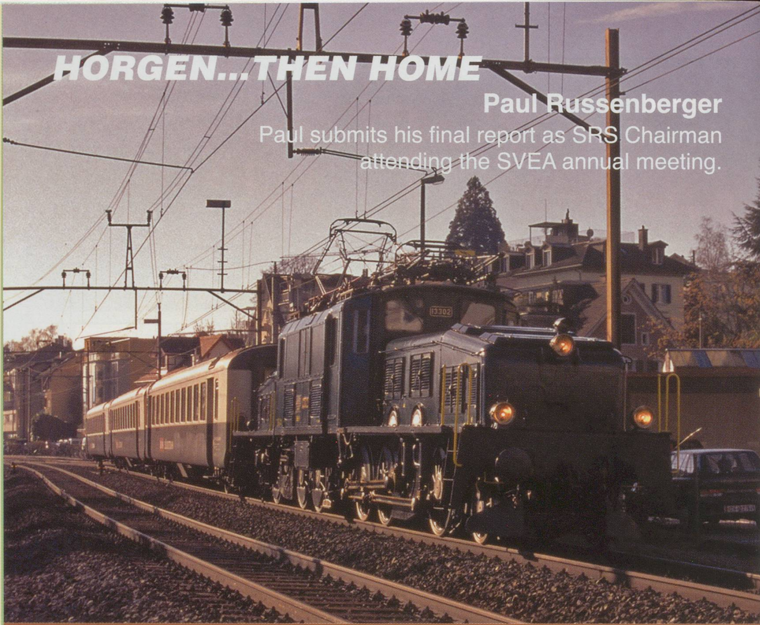
13302 passing Horgen with ecs to run round at Thalwil.