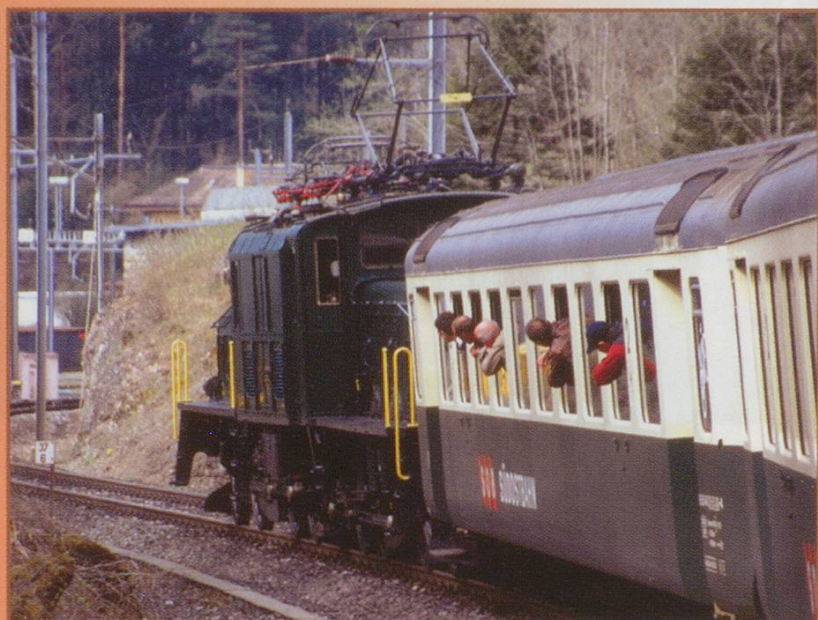
TOP: Running into Horgen.

It was then time to say "Thank you" and "Goodbye" (instead of "Auf Wiedersehen") to those who have