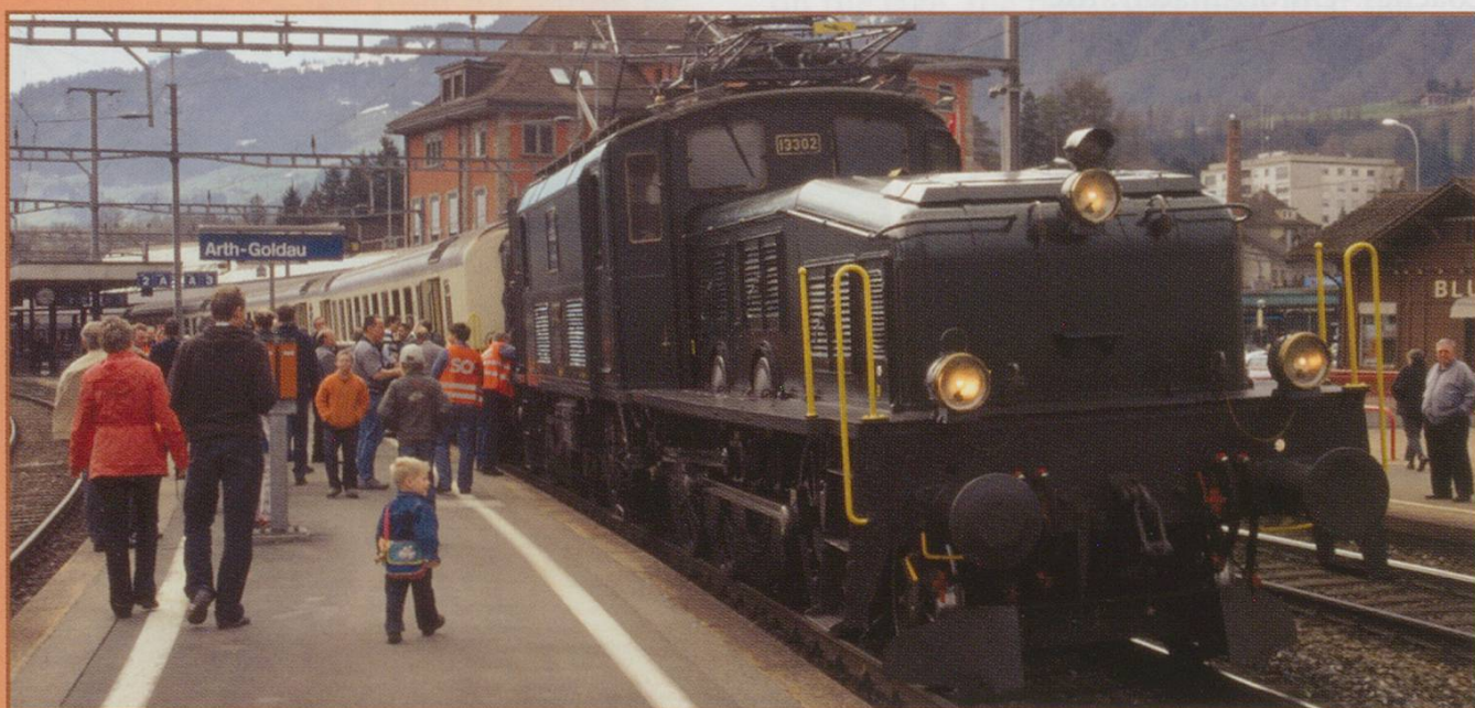
BOTTOM: Standing at Arth-Goldau.