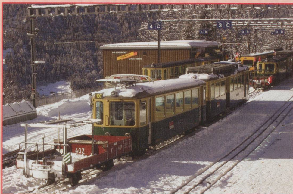
Pam Jones - RAILWAY Lunch Break in Wengen