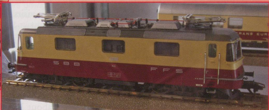
RIGHT: Mä/Trix: SBB Re 4/4II in TEE livery