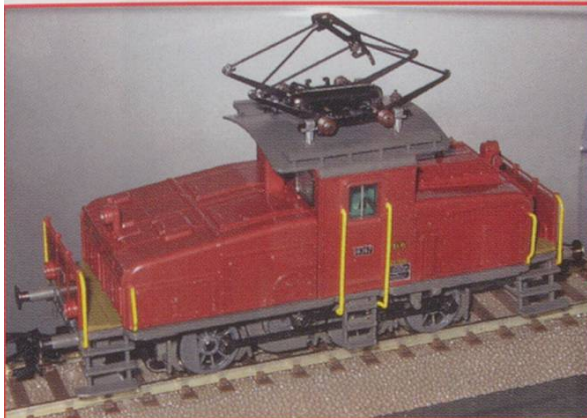
ABOVE: Mä/Trix: SBB Ee 3/3 16367