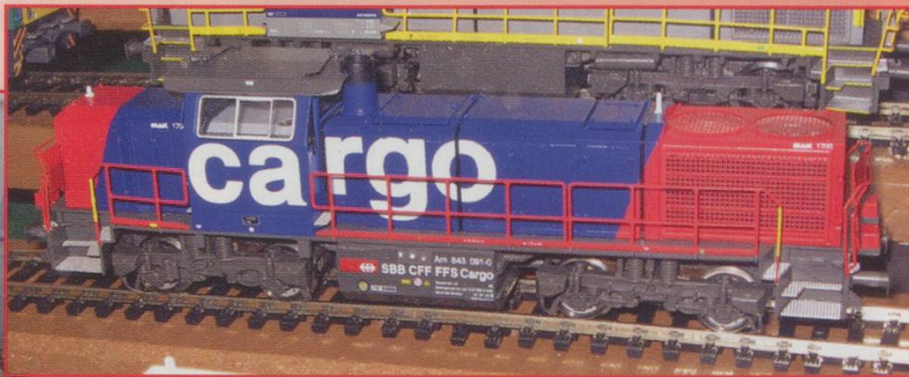
RIGHT: Mehano: SBBC Am 4/4 843.091