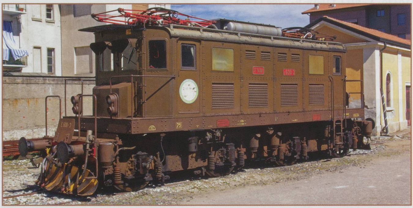
ABOVE: Italian 'private' company FNM Bo-Bo E600-3 at Luino.

was in use to give visitors a high-level view of the site.