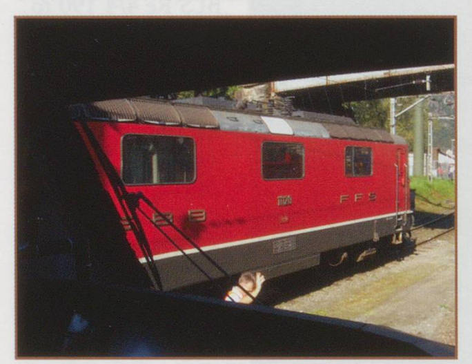
Re 460 giving cab rides passing Re 4/4 11120 at Erstfeld Depot.

used for the display of rolling stock. A wooden walkway was built from the southern end of the island platform across the loops to the exhibition area, so visitors did not have the long walk between the station and the more usual depot entrance. This effectively reduced Erstfeld to a 2-track through station, with the outside of the island platform usable for the terminating local services from/to Zug.