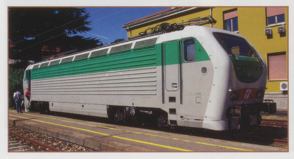
BELOW: A modern Italian locomotive E402. 154 at Luino.

E3/3 8501 and a train of 2-axle coaches from "Club San Gottardo" provided trips along the yard. Again, access from the station was by means of a wooden walkway from the island platform. The difference here was that the walkway was half-way