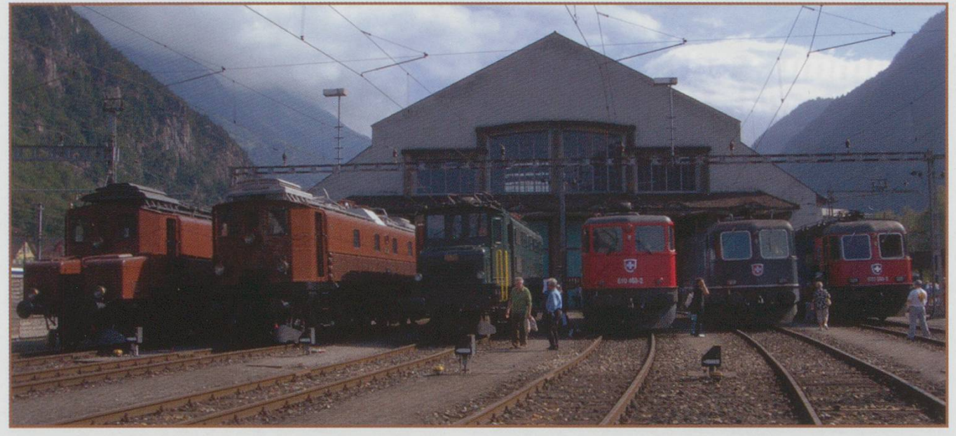
A line up of locomotives outside Erstfeld Depot.