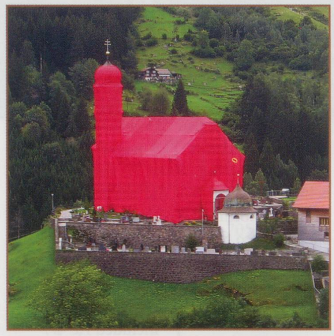
Wassen Church clothed in red to celebrate the 125th anniversary.