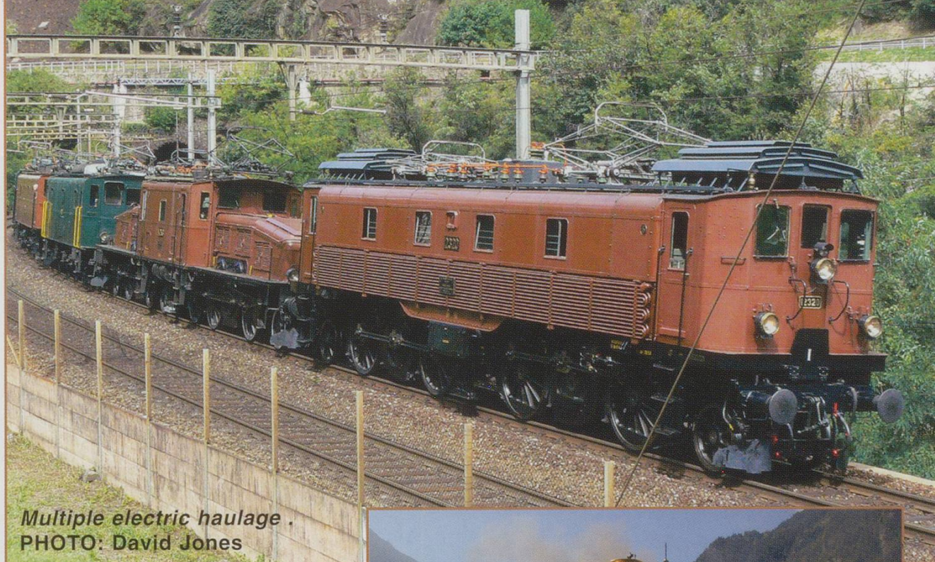
Multiple electric haulage.