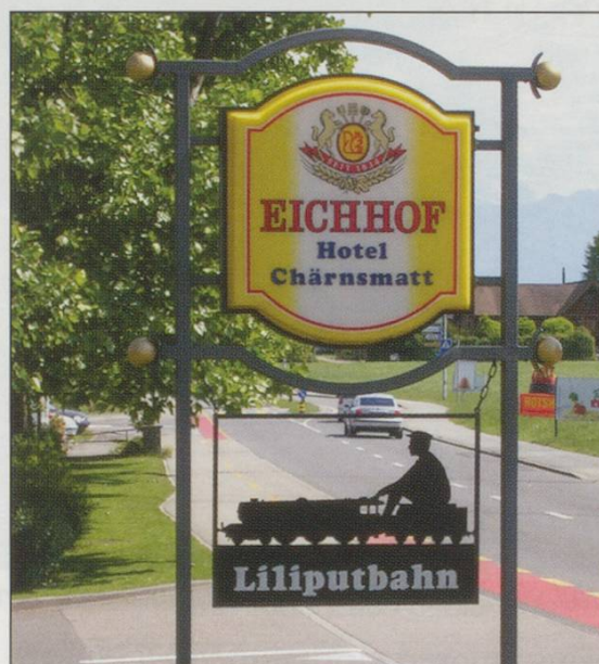
BOTTOM: The railway even has a pub sign.