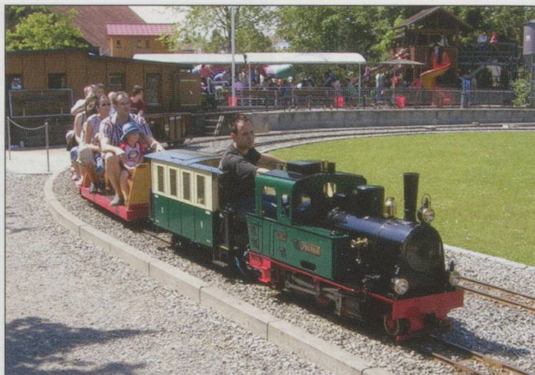
TOP: Spreewald' 2-6-0T passes with a full load.

You can spend a long time browsing the web site at www.liliputbahn-chaernsmatt.ch which provides a fascinating account of the development of the railway, its engineering and its rolling stock. There are also some very interesting photos of the almost mythical but certainly long gone line owned by the brothers Brast that used to exist near what is now the Lucerne Lido.