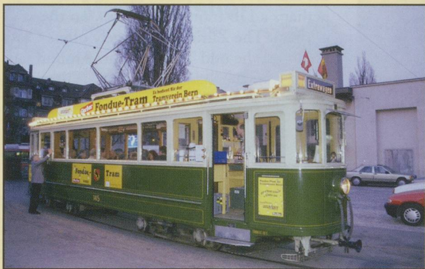
The Fondue tram lit up and full of expectant passengers ready for its journey.