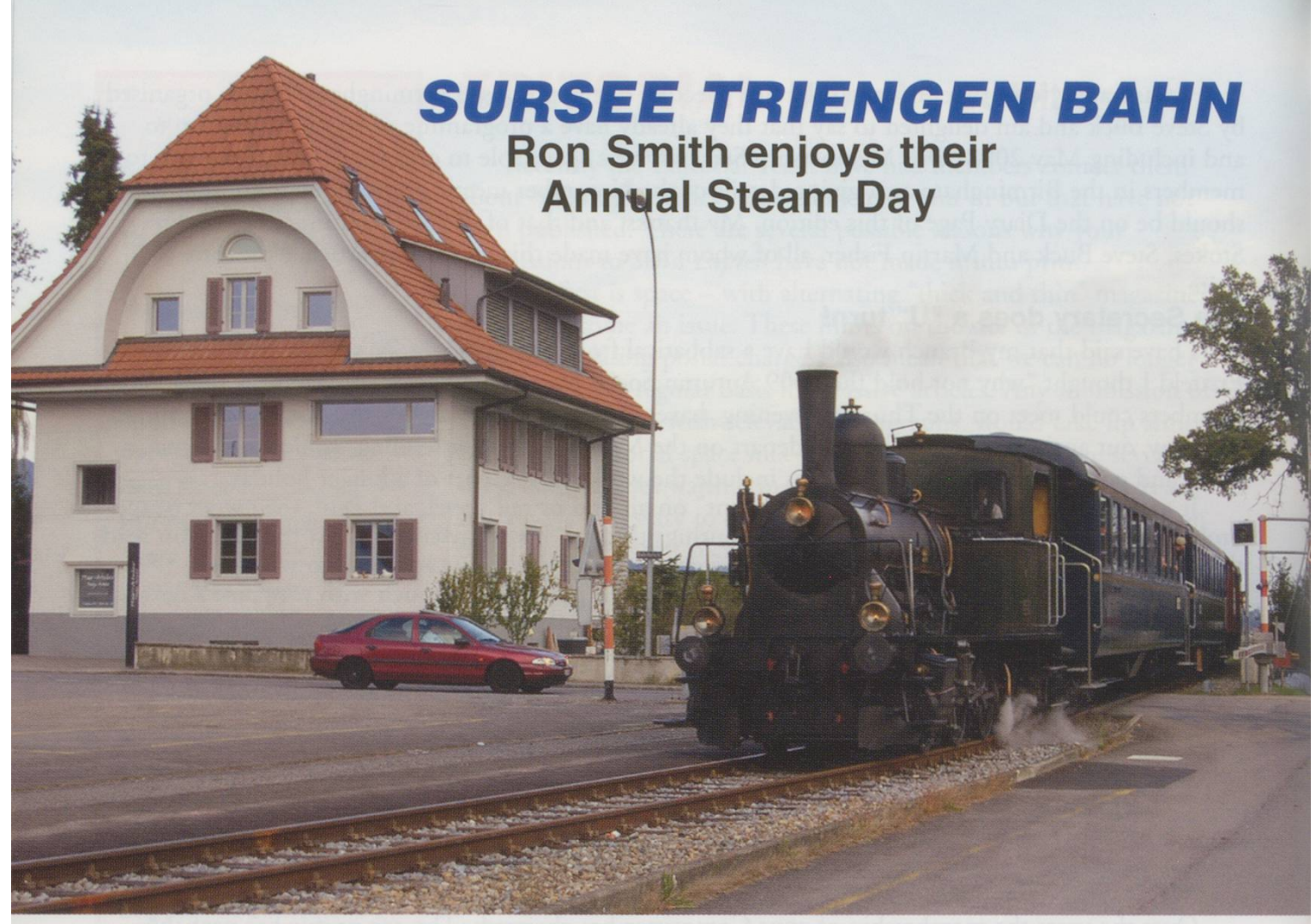
ST E3/3 No 5 at Buron

The Sursee Triengen Bahn (ST), which was described in an article in the December 2002 Swiss Express, holds an annual steam day and this was on Sunday 24th September in 2006. The line has two steam tank engines. As E3/3 No. 8522 (SLM 1913, ex SBB – this is one of the two locos converted to electric operation in 1942/43) was in the workshop under repair and in pieces, E3/3 No. 5 (SLM 1907 ex SBB 8479) was in operation with a five coach train. This was a mixture of both bogie and 6-wheeled stock, all maintained to a very high standard. The terminus station at Triengen, along with the intermediate ones at Büron and Geuensee, are really charming and Germanic. Triengen was "en fete" with the station buffet open, whilst the forecourt was busy with a North American-style Tepee sheltering the live music performers, a carousel for the children, plus lots of