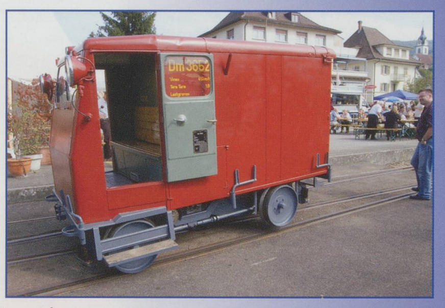
ST Draisine Dm 3652 jacked up and being turned around

There was quite an intensive service with six return trips being made, the first leaving Triengen at 08.55 and taking 23 minutes to Sursee, inclusive of the two intermediate stops. At Sursee, work was well in hand in the creation of the new fourth platform for the Luzern S-Bahn network. The ST train blasted up a short steep curve onto the main line formation, then ran right through the station on the main line and into the