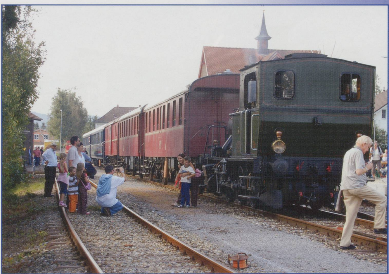
ST E3/3 No 5 and admirers at Triengen