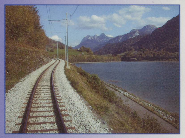
Has there ever been a better-maintained metre gauge line than the MOB?