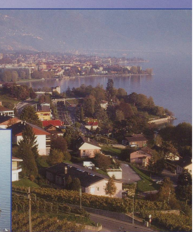
Three views from the 'Train des Vignes' through the vineyards on the trip down to Vevey.