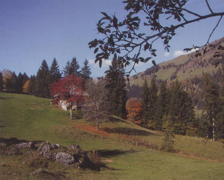
The wooded hills between Gstaad and Saanen.

The intention was to have a walk that roughly paralleled the MOB, and that the length of the walk should be determined by my energy levels as the day progressed and by whatever distractions presented themselves en-route. Having a choice of wayside stations to aim for, and then walk past, is an ideal basis for a (fairly) unstructured