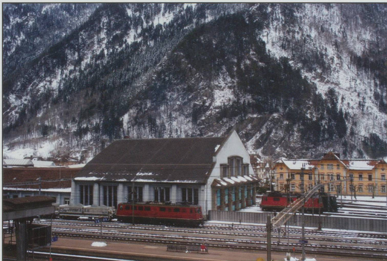
07.20 on 8th March 2006 - 11429 with a stone train for Fluelen with 11166 behind the "wall" in the depot yard.