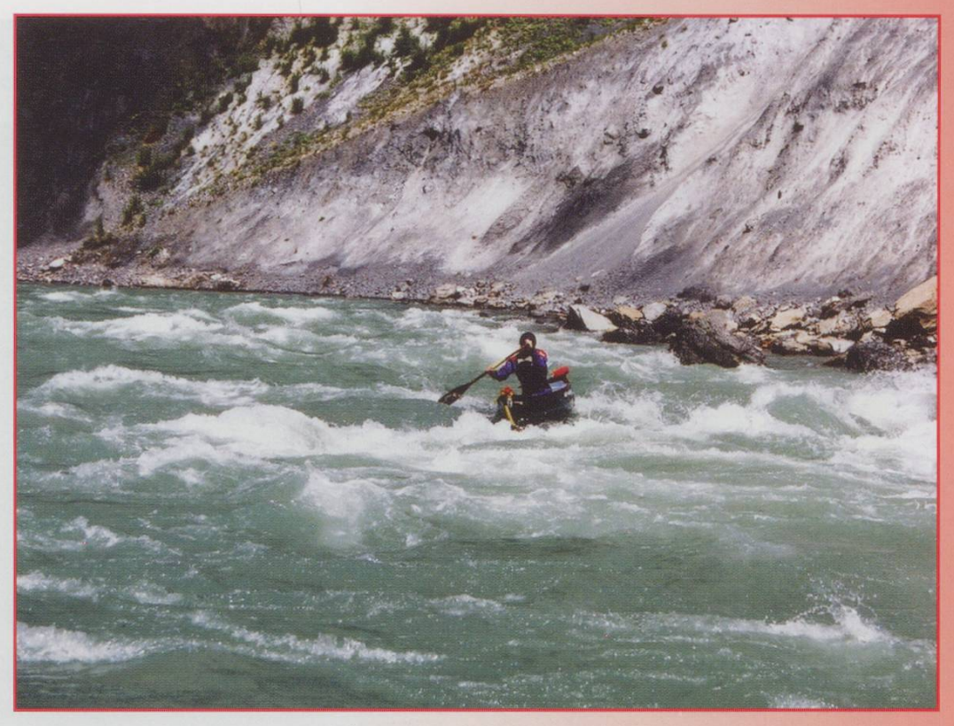
Big water, the Vorderrhein at Versam is no obstacle for Sandie.

train (yet). Re4/4 ii will be eliminated gradually from passenger services as new fixed formation sets displace them at one end with FLIRT and other "mobile greenhouses" displacing them at the other - but not for the next few years. So the moral then is get them while you can. I shall be persuading Sandie that another course at Kanuschule Versam is just what she needs.