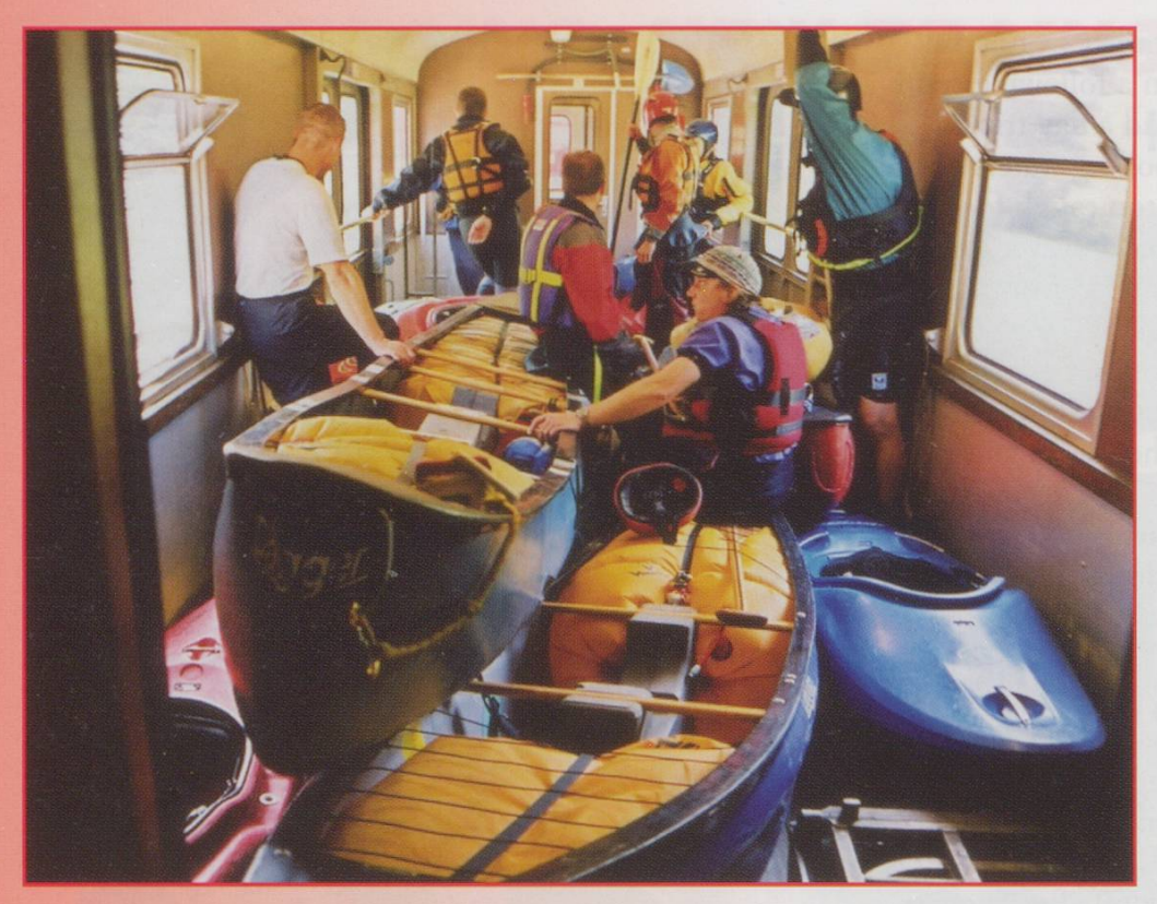
Is there room in here for a little one (or a goat)?

Chaos abounds at Versam as RhB Ge4/4 ii 627 waits on 20th June 2005.