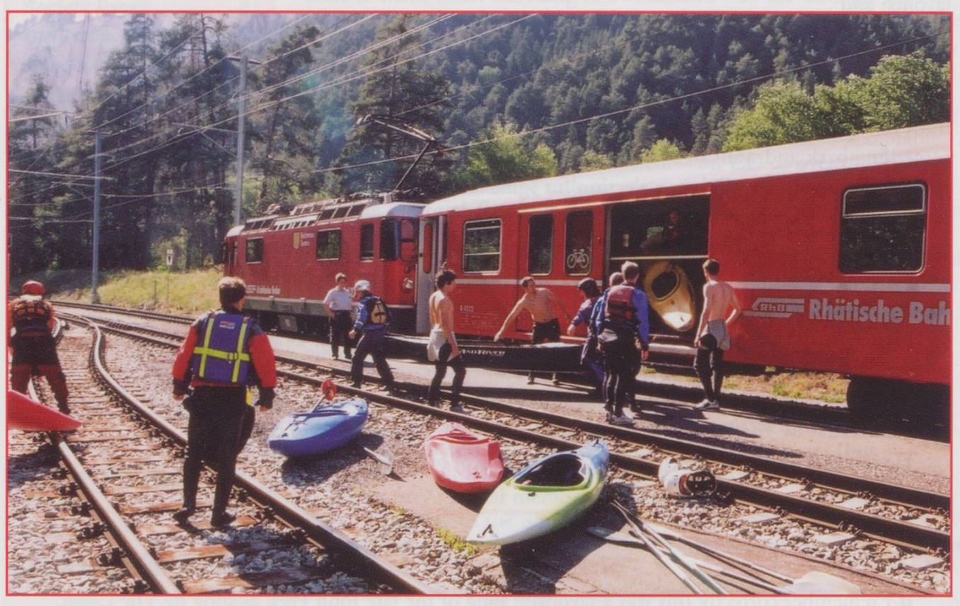
Chaos abounds at Versam as RhB Ge4/4 ii 627 waits on 20th June 2005.