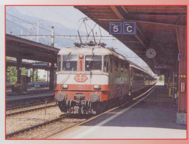
Re 4/4 ii 11141, still in orange livery, provides some variety on I R767 at Sargans on 19th June 2005.

Canoes are loaded onto a Disentis service at Trin.