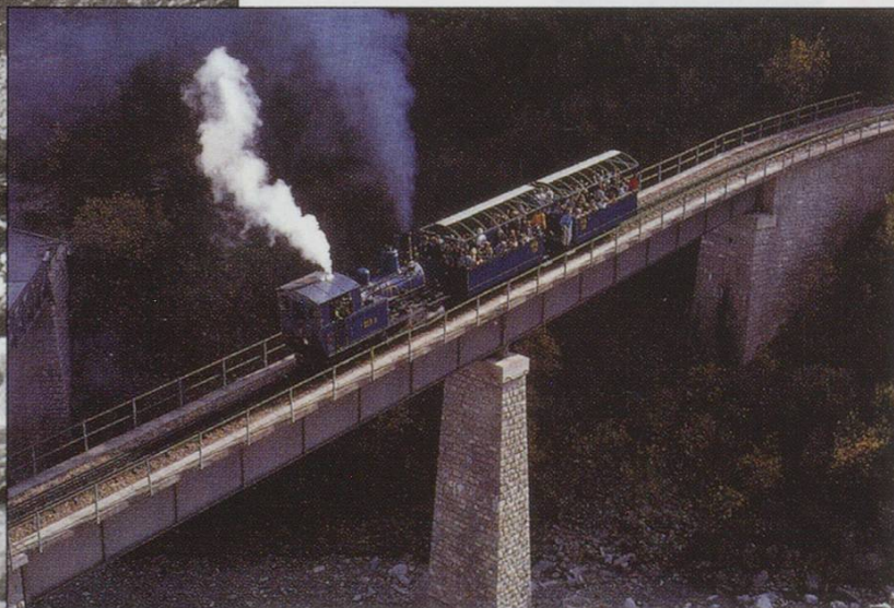
Wilerbrücke after September 1955