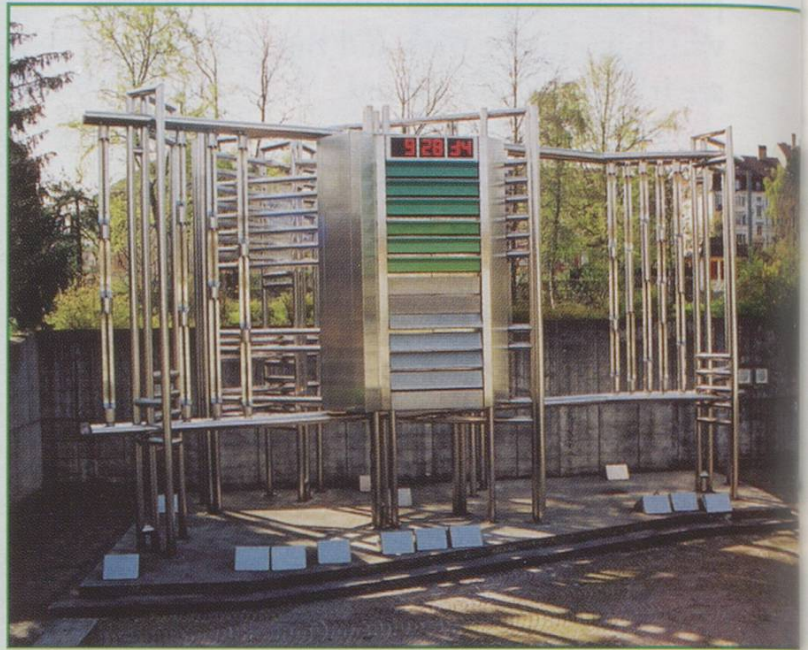
TOP: The Carillon at the Musée International d'Holographie, La Chaux-de-Fonds.