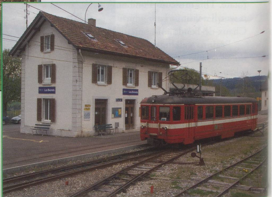
BOTTOM: Les Brenets station