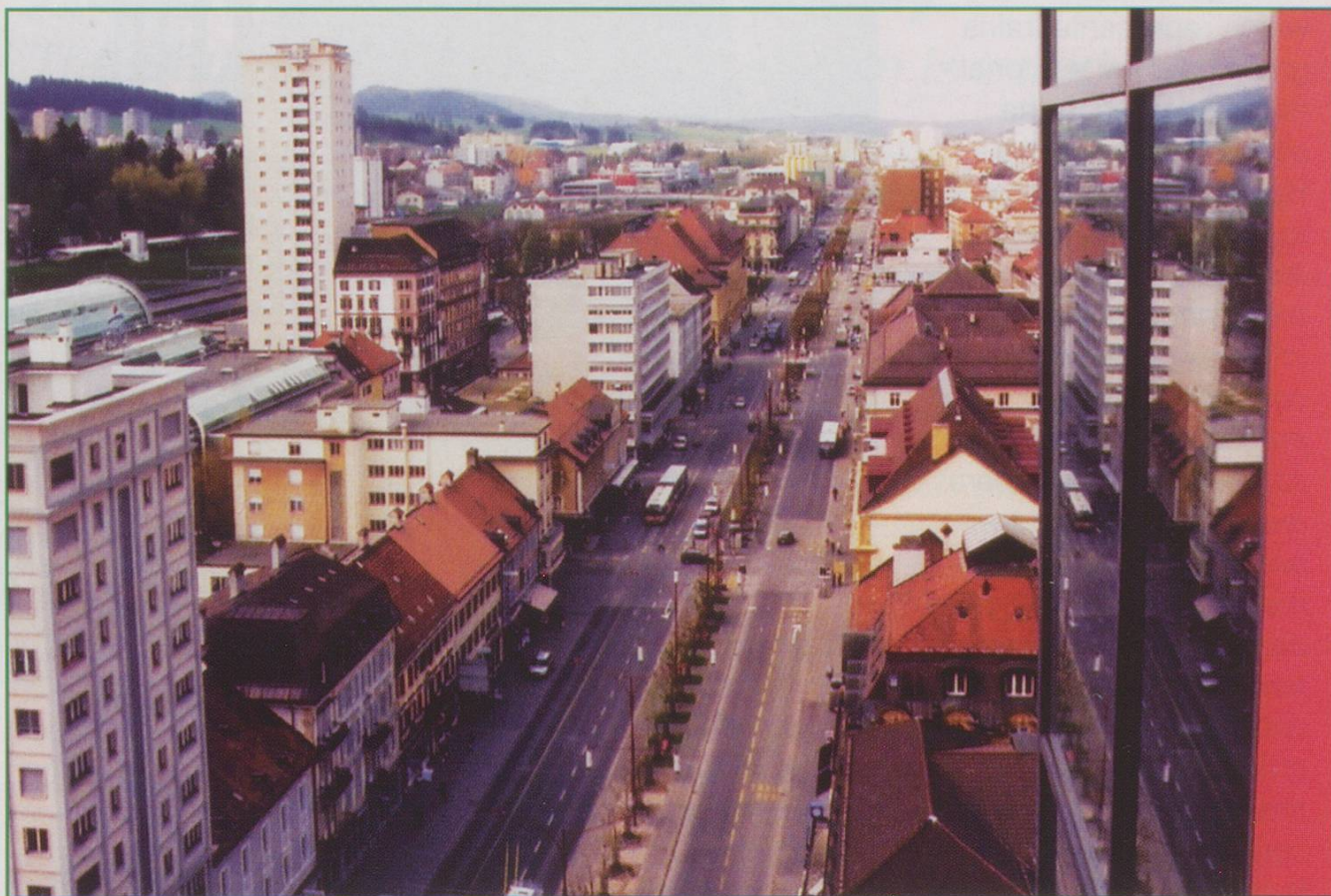
Looking along the Avenue Lépold-Robert from the Tour Espacité, La Chaux-de-Fonds.

The regular SBB service to La Chaux-de-Fonds climbs steadily out of Neuchâtel into the heart of the Juras. With a reversal at Chambrélien the route passes through a 3259 metre tunnel not far short of La Chaux-de-Fonds. The town is at the head of the valley to La Loc and on into France. Many of the world famous Swiss watch companies have their factories located between the towns.