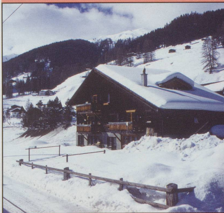
Davos Frauenkirch, 23.3.06