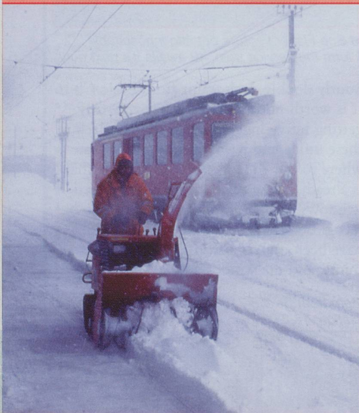
Snow is blown away from the platform at Ospizio Bernina - and into the path of RhB 49, 19.2.06