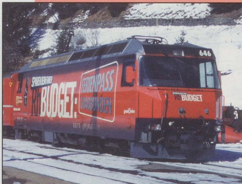
RhB Ge 4/4 646 calls at Bergun, 21.2.06