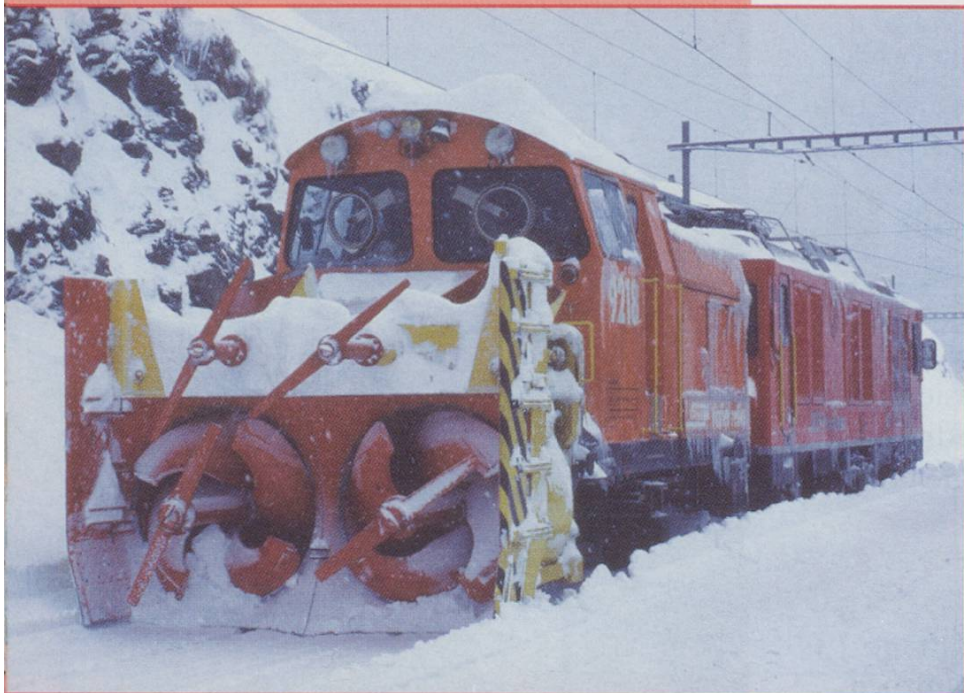
RhB 9218 and 802 at rest in Alp Grum, 19.2.06