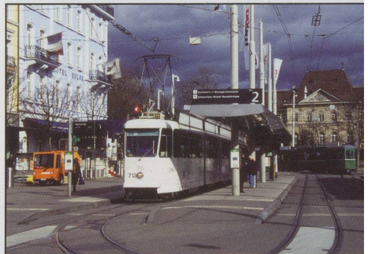
Bern tram Be 4/8 713 in Basle outside the SBB station. 18.2.06

hourly double-deck trains from Basle-Chur. It is worth noting that it is not very easy getting heavy luggage up to the top deck of these units, and even harder to find somewhere to put the luggage in a carriage that is already filling up. Although the curved windows hamper photography, it has to be recognised that such thoughts would not have been uppermost in the designers' minds and the windows do at least provide