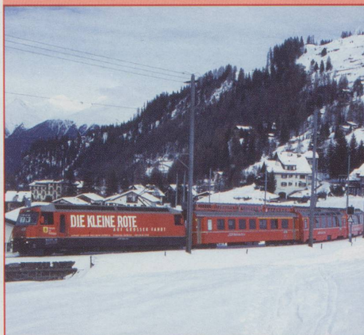
RhB Ge 4/4 650 "Seewis" begins the climb out of Bergun, 21.2.06

The next day we took the 09.00 train down to Chur and at Reichenau we had a fleeting, tantalising, glimpse of Ge6/6 'Crocodile' 414 on a freight. As we came into Chur Ae6/6 11466 was seen, equally briefly, in a siding with one bogie down in the ballast and Bm6/6 18511 in attendance with a 'Hilfswagen'. Following a tight connection we took the train up to Arosa where sunny intervals alternated with snow flurries. It was during one of the sunny spells that we did the 'tourist thing' and, looking like extras from 'Doctor Zhivago', could be seen taking a horse-drawn sleigh around the lake and village. On return to Chur I used my knee as an excuse to stay