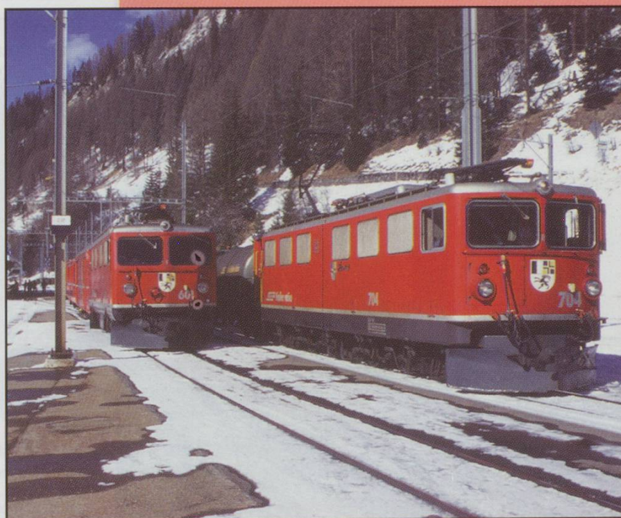
RhB Ge 4/4 601 "Albula" is overtaken by Ge 4/4 704 "Davos" on a freight, Bergun, 21.2.06