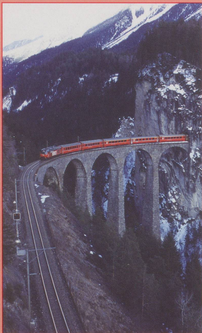
RhB Ge 4/4 646 "Sta Maria/Val Mustair" on the Landwasser Viaduct, 21.2.06

on the station whilst the others did some shopping. 11466 and 18511 reappeared, 11466 being taken across the station and parked inside the engine shed.