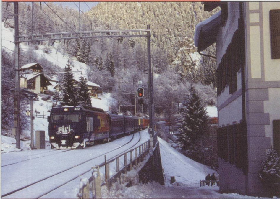
RhB Ge 4/4 652 "Lenzerheide" brings a Chur bound train into Filisur, 18.2.06. Hotel Grischuna to the right.