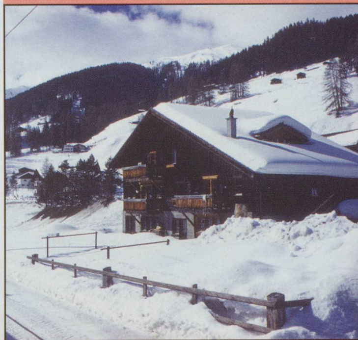
Davos Frauenkirch, 23.3.06