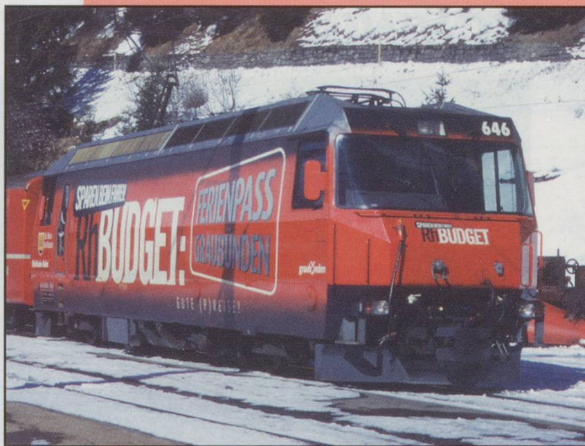
RhB Ge 4/4 646 calls at Bergun, 21.2.06

However, as we drew into Filisur, I noticed some old coaches in the Davos platform and then could see further down the platform smoke drifting skywards. I went over to the Davos platform as quickly as I could, just in time to photograph No. 107 backing off from the turntable. After a few minutes, the tour party boarded their train, leaving a few people to photograph its departure from the platform. To my surprise another member of this select group asked me to look the opposite way to see blue Ge6/6 412 appearing from the Davos direction with a water-tanker in tow. 107 duly left down the main line towards Thusis and, after it had run-round its tanker, so too did 412. A great way to end the holiday. Unfortunately, it was half an hour later when Morris & Annie arrived back in Filisur unaware of what had been going on just a few miles down the valley. Then, on the Saturday, it was back home to Britain.