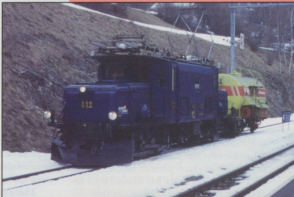
RhB Ge 6/6 "Crocodile" 412 at Filisur, 24.2.06