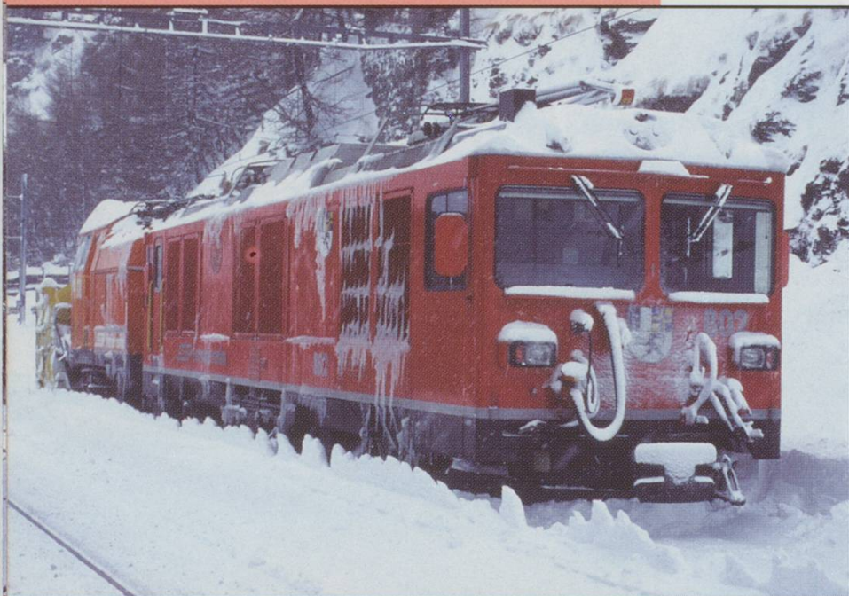
RhB GRM 4/4 802 and Xrotet 9218 await the return of their crew at Alp Grum, 19.2.06