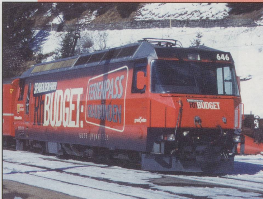
RhB Ge 4/4 646 calls at Bergun, 21.2.06

However, as we drew into Filisur, I noticed some old coaches in the Davos platform and then could see further down the platform smoke drifting skywards. I went over to the Davos platform as quickly as I could, just in time to photograph No. 107 backing off from the turntable. After a few minutes, the tour party boarded their train, leaving a few people to photograph its departure from the platform. To my surprise another member of this select group asked me to look the opposite way to see blue Ge6/6 412 appearing from the Davos direction with a water-tanker in tow. 107 duly left down the main line towards Thusis and, after it had run-round its tanker, so too did 412. A great way to end the holiday. Unfortunately, it was half an hour later when Morris & Annie arrived back in Filisur unaware of what had been going on just a few miles down the valley. Then, on the Saturday, it was back home to Britain.