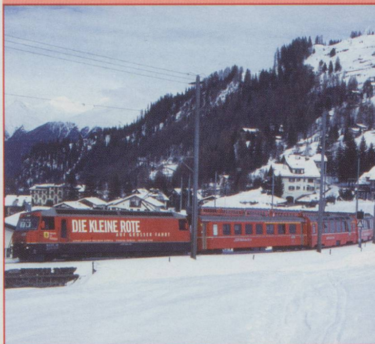
RhB Ge 4/4 650 "Seewis" begins the climb out of Bergun, 21.2.06

The next day we took the 09.00 train down to Chur and at Reichenau we had a fleeting, tantalising, glimpse of Ge6/6 'Crocodile' 414 on a freight. As we came into Chur Ae6/6 11466 was seen, equally briefly, in a siding with one bogie down in the ballast and Bm6/6 18511 in attendance with a 'Hilfswagen'. Following a tight connection we took the train up to Arosa where sunny intervals alternated with snow flurries. It was during one of the sunny spells that we did the 'tourist thing' and, looking like extras from 'Doctor Zhivago', could be seen taking a horse-drawn sleigh around the lake and village. On return to Chur I used my knee as an excuse to stay