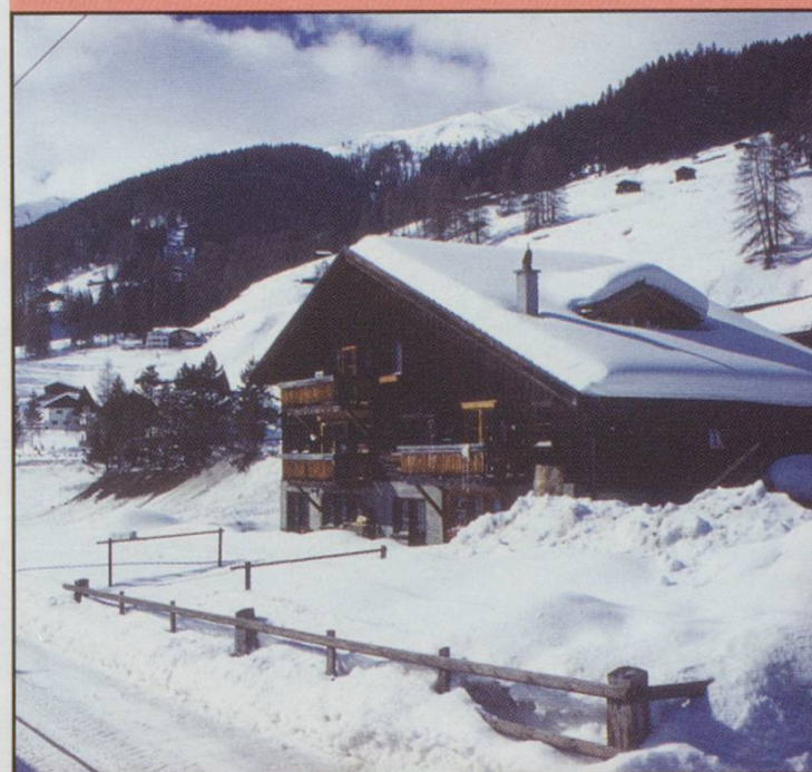
Davos Frauenkirch, 23.3.06