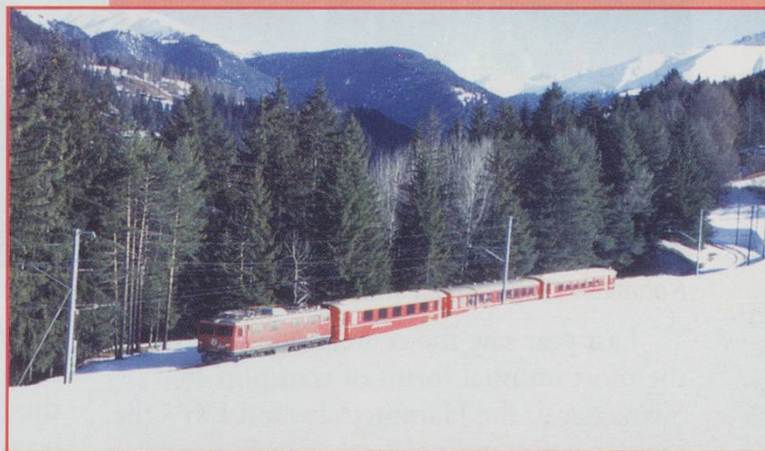
RhB Ge 4/4 608 "Madrisa" approaches Filisur from Davos, 23.2.06