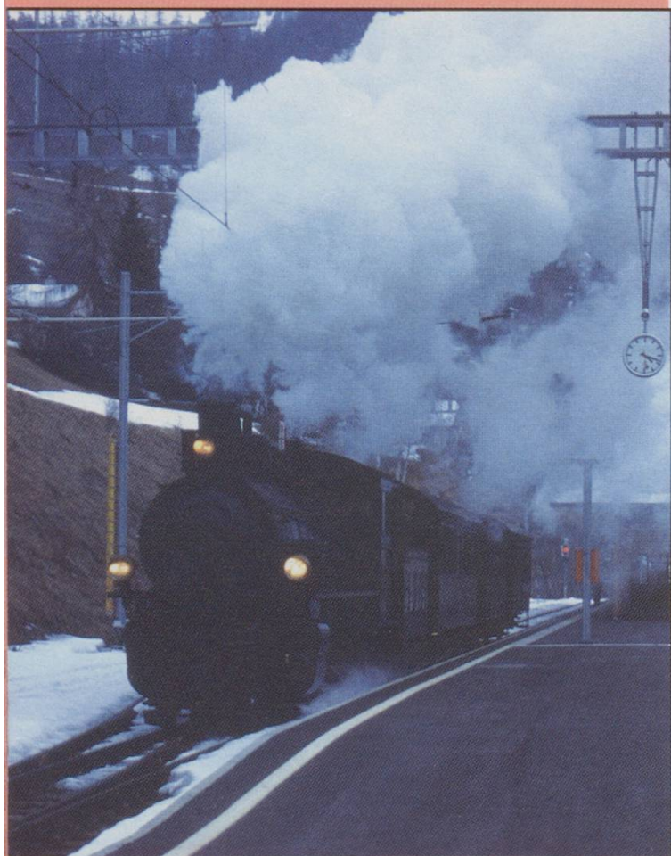
In poor light, RhB G 4/5 107 sets off from Filisur, 24.2.06

were times when our steps sunk some two feet into the snow as we lost the path. Faced with the choice of walking over to the railway line and walking along the line itself or scrambling up towards the path we had been on earlier we chose the latter option but it proved to be longer and quite demanding due to the deep snow. It was a relief when we regained the correct path that led us on to fine sunlit views of the Wiesen Viaduct, before following the path alongside