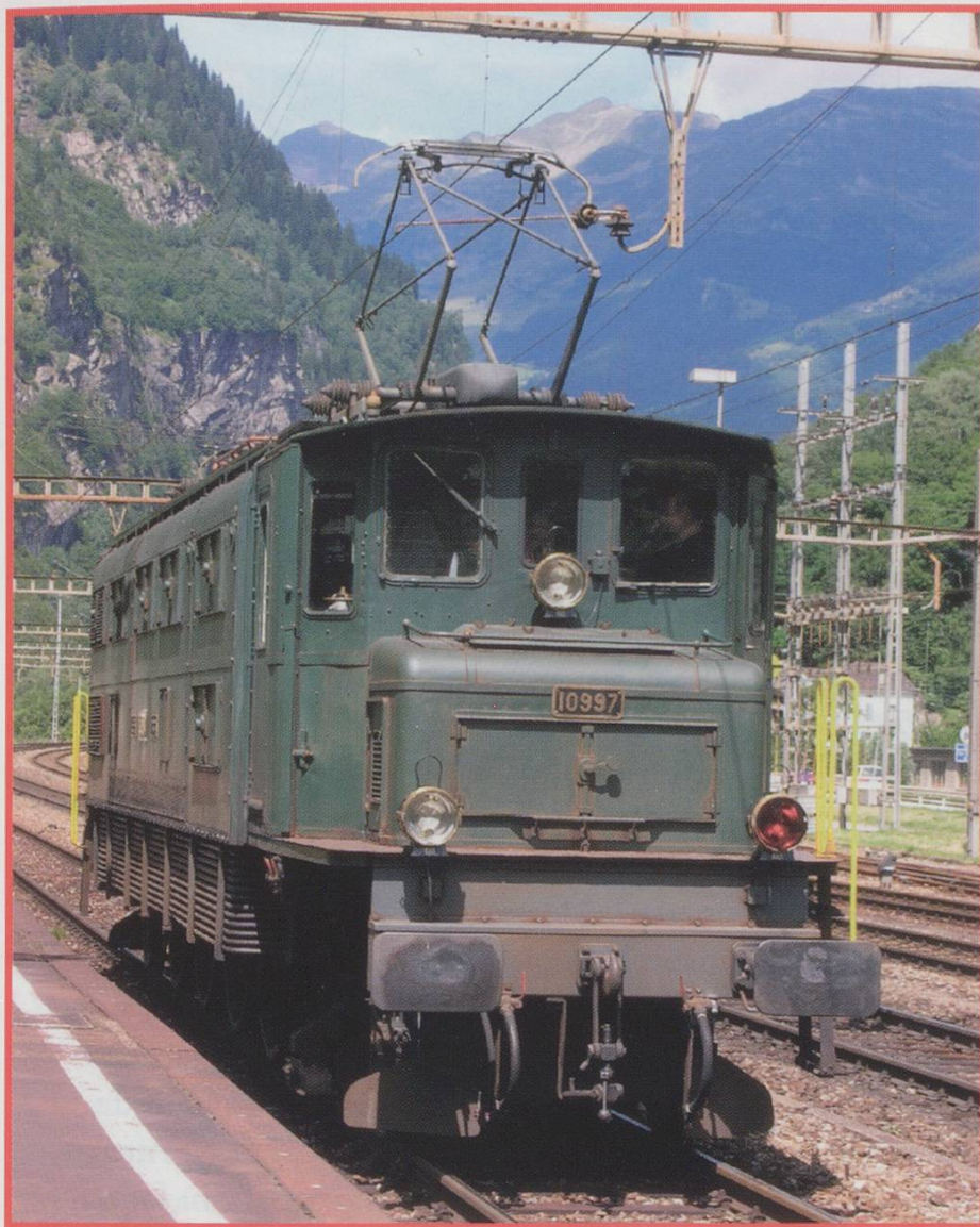
ABOVE: Waiting in Lavorgo for the Cisalpino