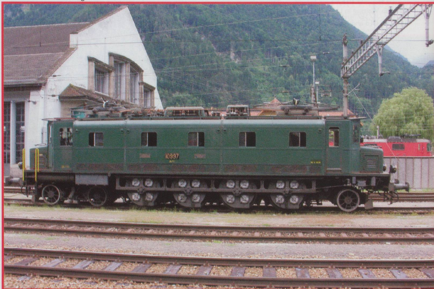
The Ae 4/7 standing at Erstfeld