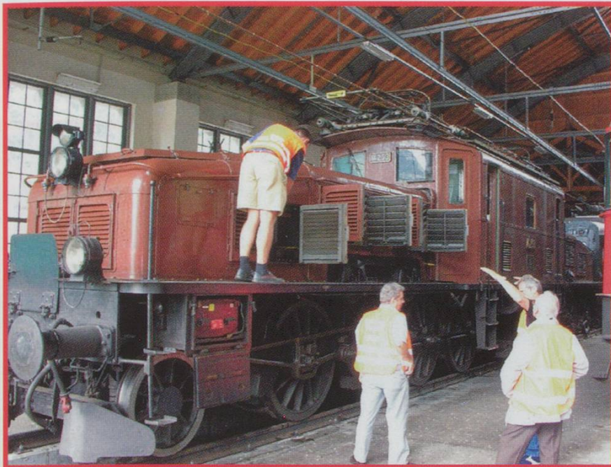
Examining Gotthard Crocodile, Ae 6/8 No. 14253 in Erstfeld shed.