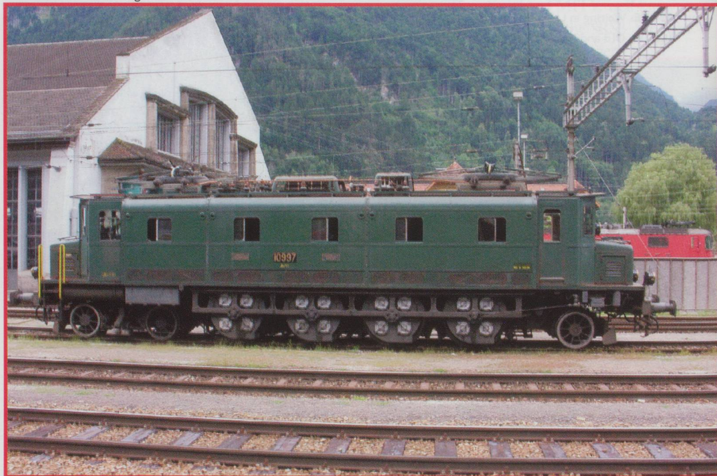
The Ae 4/7 standing at Erstfeld