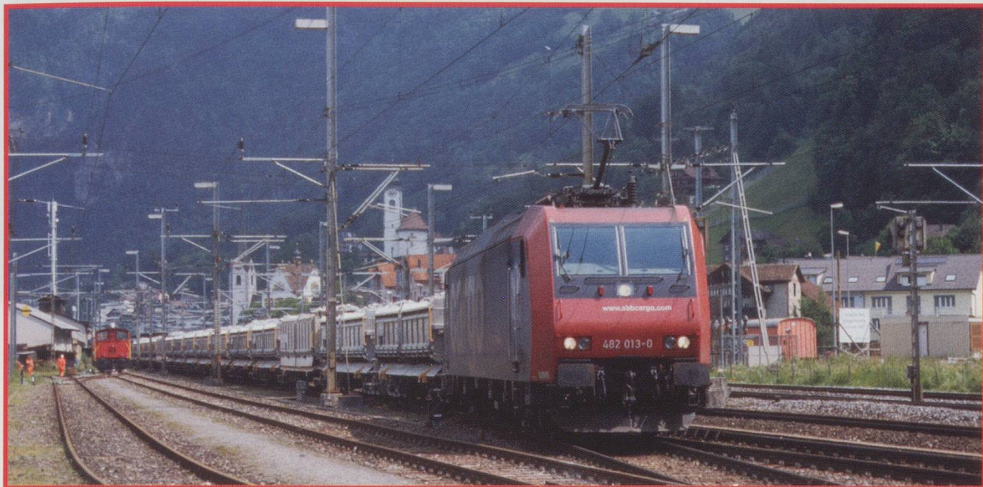
482013 moving forward before reversing its train over the level crossing. The on-board videocam is just above the handrails on the side of the loco.