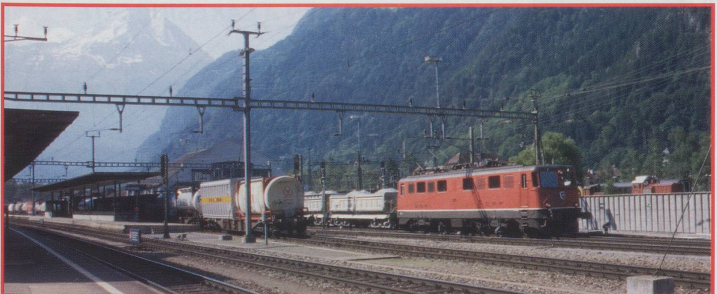
BELOW: Ae6/6, 11441, departing Erstfeld with a stone train for Flüelen.