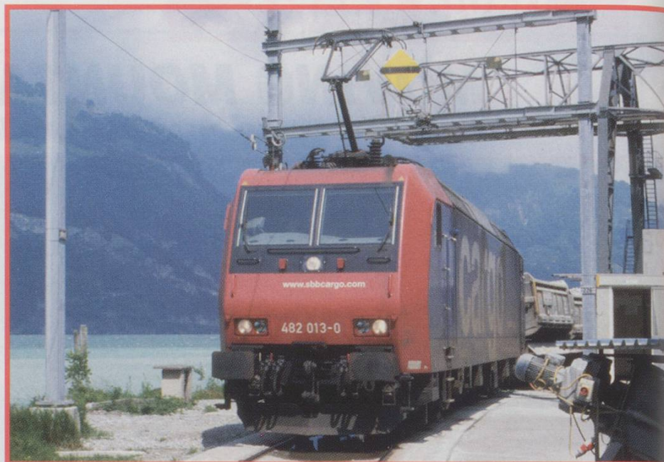
ABOVE: 482013 at the discharge site with Vierwaldstättersee in the background. The yellow diamond with a black stripe above the loco denotes the end of the overhead power supply hence the need to use the front pantograph.

I paused for a few minutes at the crossing to watch passing traffic on the main line. I was just about to continue when a class 482 could be seen approaching from the south. It arrived with what I assume was the 10.48 stone train from Erstfeld, a journey of just 9km. The train passed me and the loco ran round. It then drew forward before reversing across the crossing which was guarded by an SBB Cargo employee holding a red flag while another gave instructions to the driver by radio. Once over the crossing the line becomes two sidings and the train reversed into the south side siding. Here the train was split. The loco and front portion drew forward and then reversed down the north side siding towards the discharge facility which is situated on the southern shore of Vierwaldstättersee at the end of