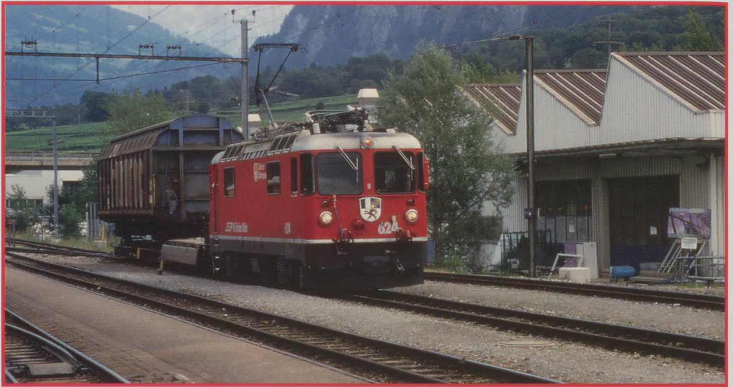
ABOVE; Ge4/ II 624 arrives at Untervaz with a standard gauge truck atop a narrow gauge transporter.

I found a dual gauge railway line alongside the road, crossing the bridge and leading into the Holcim (formerly Bündner Cement Untervaz) cement factory on the opposite side of the river. Following a brief investigation of the line as it entered the factory I returned to cross the bridge and was delighted to see the works diesel locomotive pushing a train of empty standard gauge cement tankers towards the industrial complex. I later realised that this was not just a fortunate coincidence but an event that took place on a regular basis throughout the working day. Next I tracked back along the road to determine the source of the line at Untervaz station and found it ran down behind the station area and eventually into a yard for transferring the wagons to the SBB. Of course I was primarily interested in any RhB operations on this dual gauge line and therefore decided to spend time around the station waiting to see any such action - after all there was a line of the typical RhB cement wagons waiting in the yard.