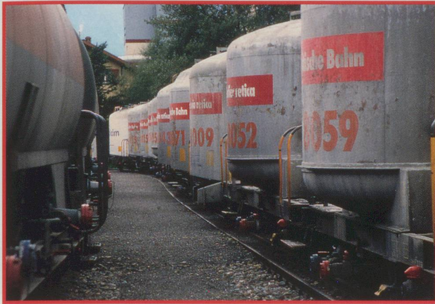
ALL PHOTOS BY BRIAN MASON 26/08/02

LEFT: RhB Mohrenköpfe on the dual gauge lines in Untervaz station yard waiting to be attached to passing freight trains.