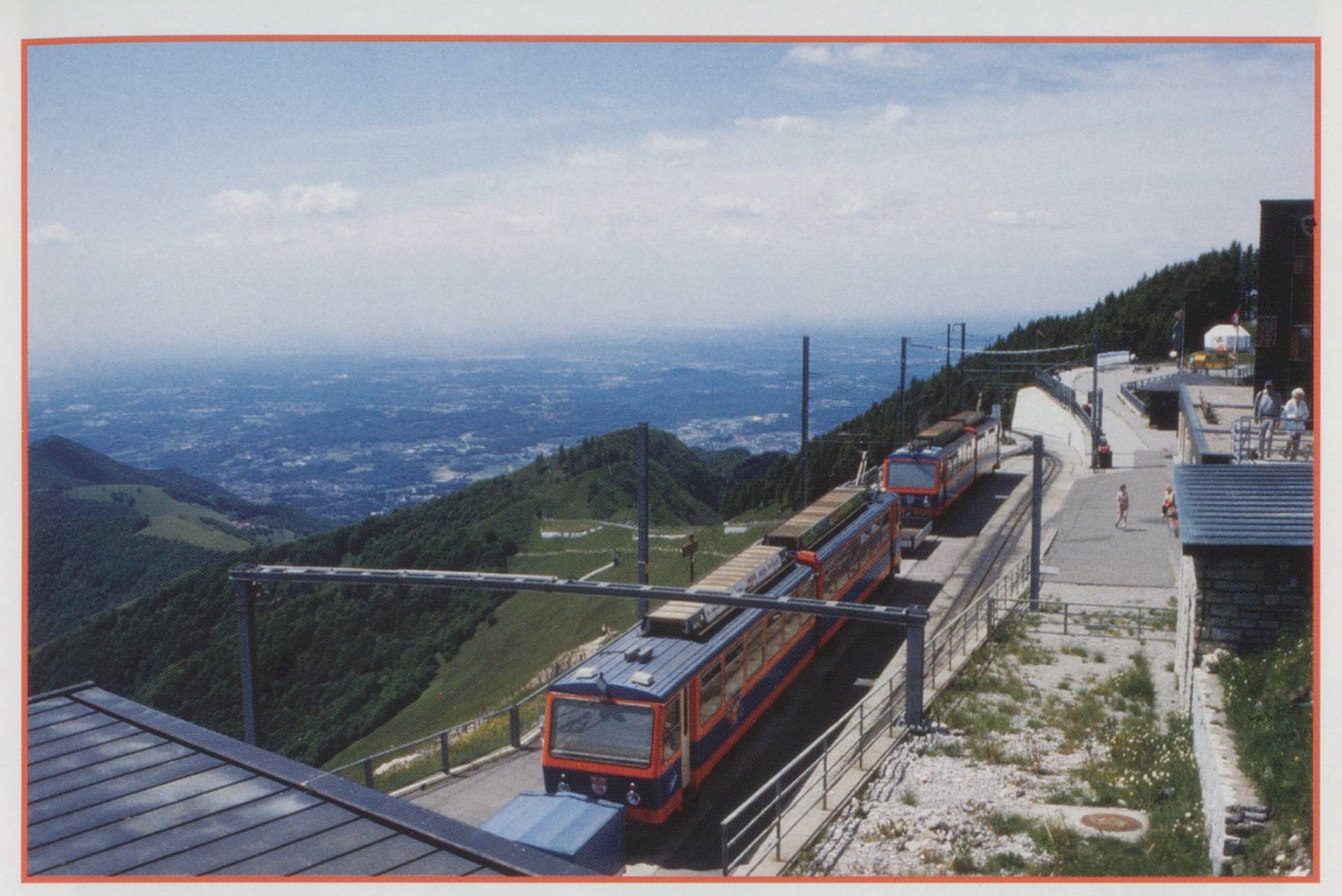
Generoso Vetta station (1592m) with units 12 & 13 waiting to return to Capolago. The view is to the south/south west across the Lombardy plain in Italy.

the train pass and then suddenly ran off into the woodland. The final approach to Vetta is more open, giving a hint of the spectacle at the summit.