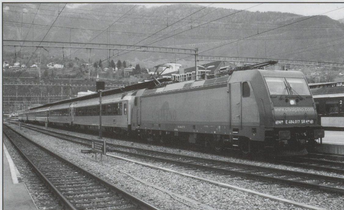
Mark Barber took this picture of SBB Re484 017 as described above. The location is Thun on 31.10.05.

December all EC services via the Simplon are diagrammed for Re484 haulage.