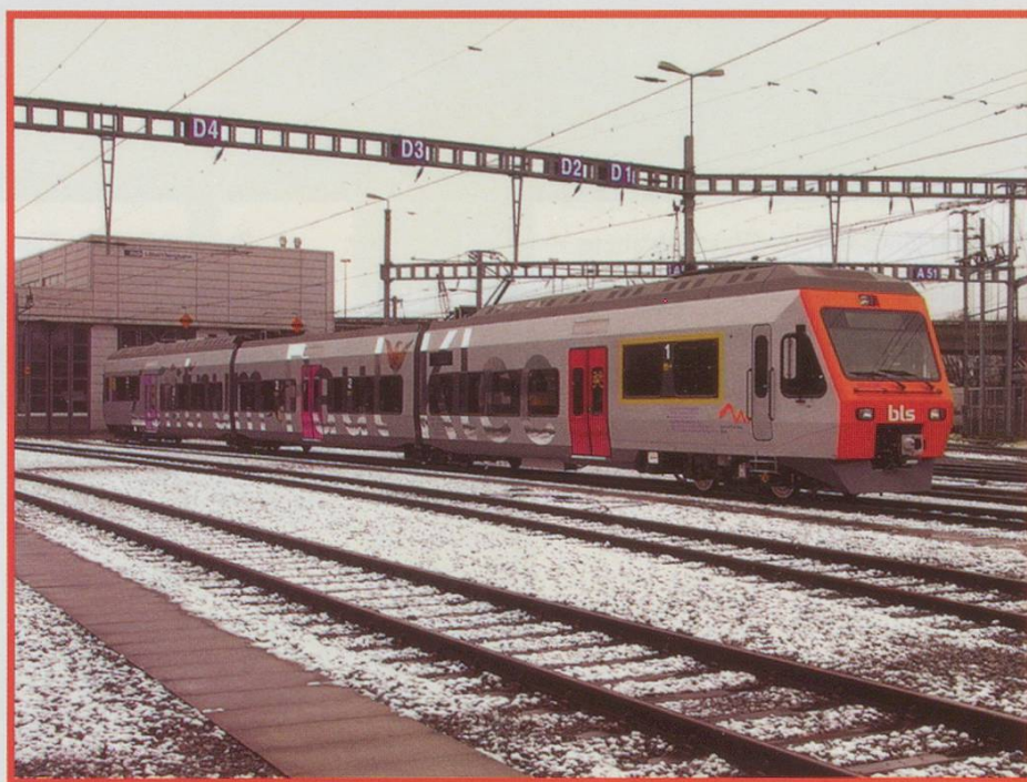
Not previously noted is this new livery for bls NINA 35 which celebrates Paul Klee, Switzerland's best know artist. A new gallery/museum devoted to Klee recently opened in Bern.

The westbound bore of the Lötschberg Base Tunnel broke through (without publicity) on 15th March, five weeks before the public breakthrough for the eastern bore on 28th April (last Swiss Express )