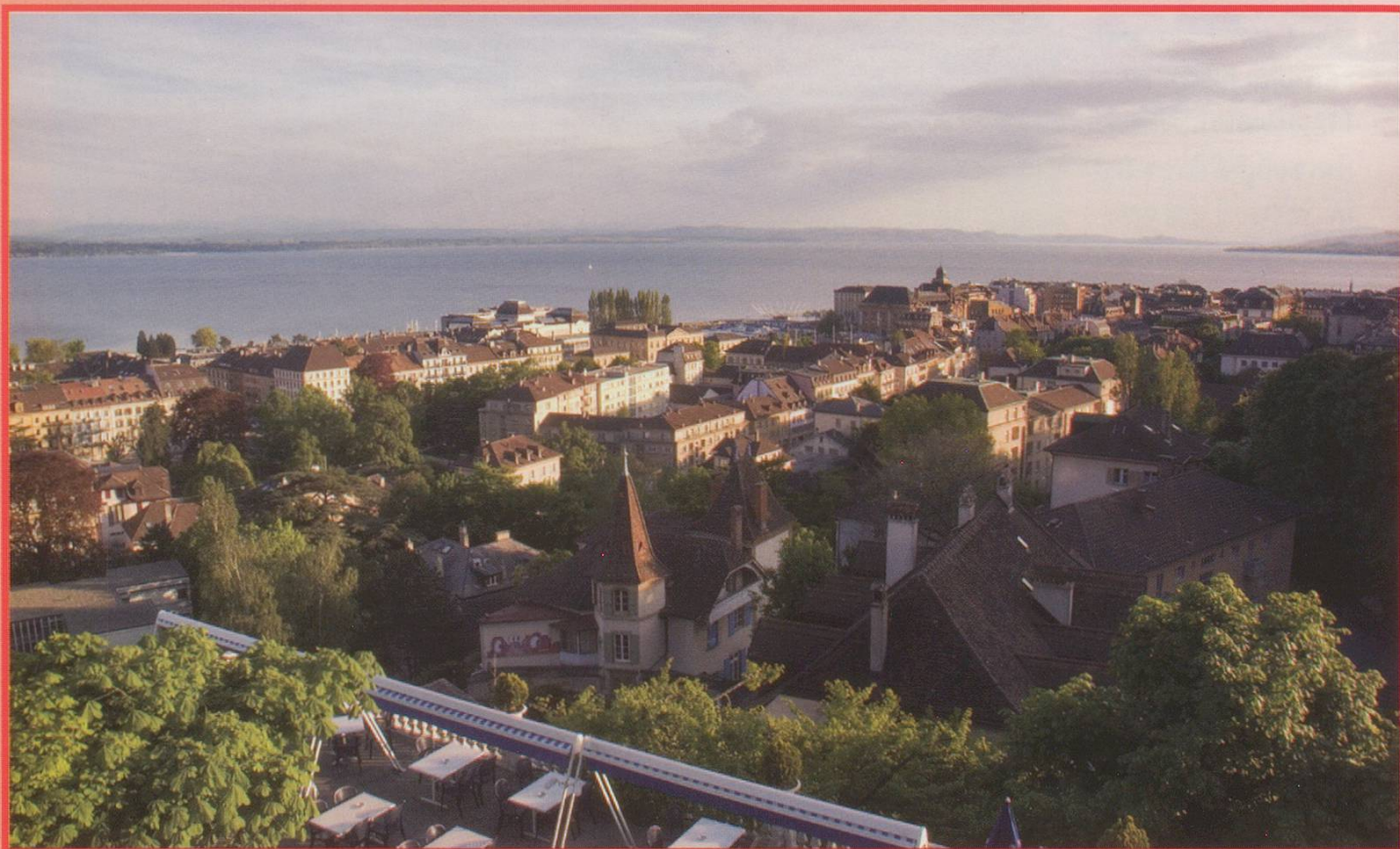
The spectacular view from one of the lakeside bedrooms of the Hotel des Alpes, a good choice for those transport enthusiasts who travel with their loved ones!

Gerry takes us on a stroll round Neuchâtel