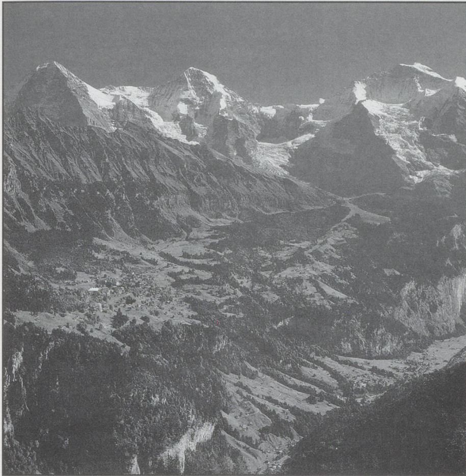
Isenfluh (1084 m) in the Bernese Oberland. View from Sulwald above the village onto Eiger, Mönch and Jungfrau mountains. To the left, the resort of Wengen, in the valley below the resort of Lauterbrunnen.