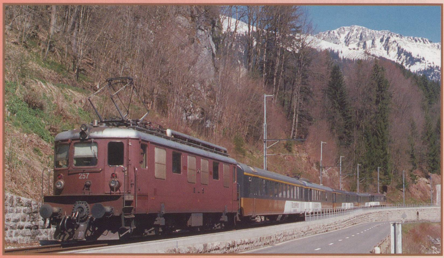
Ae4/4 257 brings up the rear of the 'Golden Pass Panoramic' push-pull set as it heads down the valley from Boltigen forming RX2369 Zweisimmen I2h2I - Interlaken Ost I3h24.

Many aspects of Swiss railways have changed quite considerably over the last five years. Two specific occurrences are significantly changing the Swiss railway scene: the 'merger mania' and the 'railcar revolution' which have seen many Swiss railways replace their stock with modern 'modular' designs such as the Stadler GTW series. These changes appear to have manifested two schools of thought in the enthusiast arena. One is that the modern trains and merged railways have destroyed the unique character of Swiss railways, the other is that you can never stand in the way of modernisation at any point in history and thus the merged railways and new stock are just as interesting as 'the old stuff'.