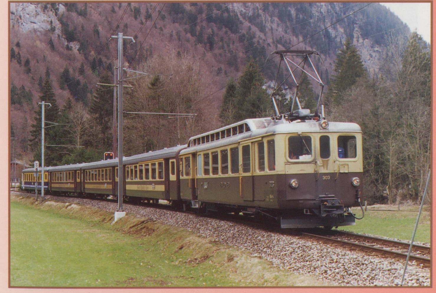
BOB 303, one of the 1949 units which were delivered at the time of electrifiction arrives at Zweilütschinen with a Lauterbrunnen - Interlaken portion. 06/04/04

Often dismissed as boring, due to its regular interval operations, I came to the conclusion that BOB operations are 'samey' but far from boring. First of all, despite not being a loco hauled service, the BOB traction units (ABDeh4/4 or ABDeh 4/4) act very much like locos, and despite the presence of driving trailers, many trains are formed in 'loco and coaches' style. Indeed one day I was there, all of