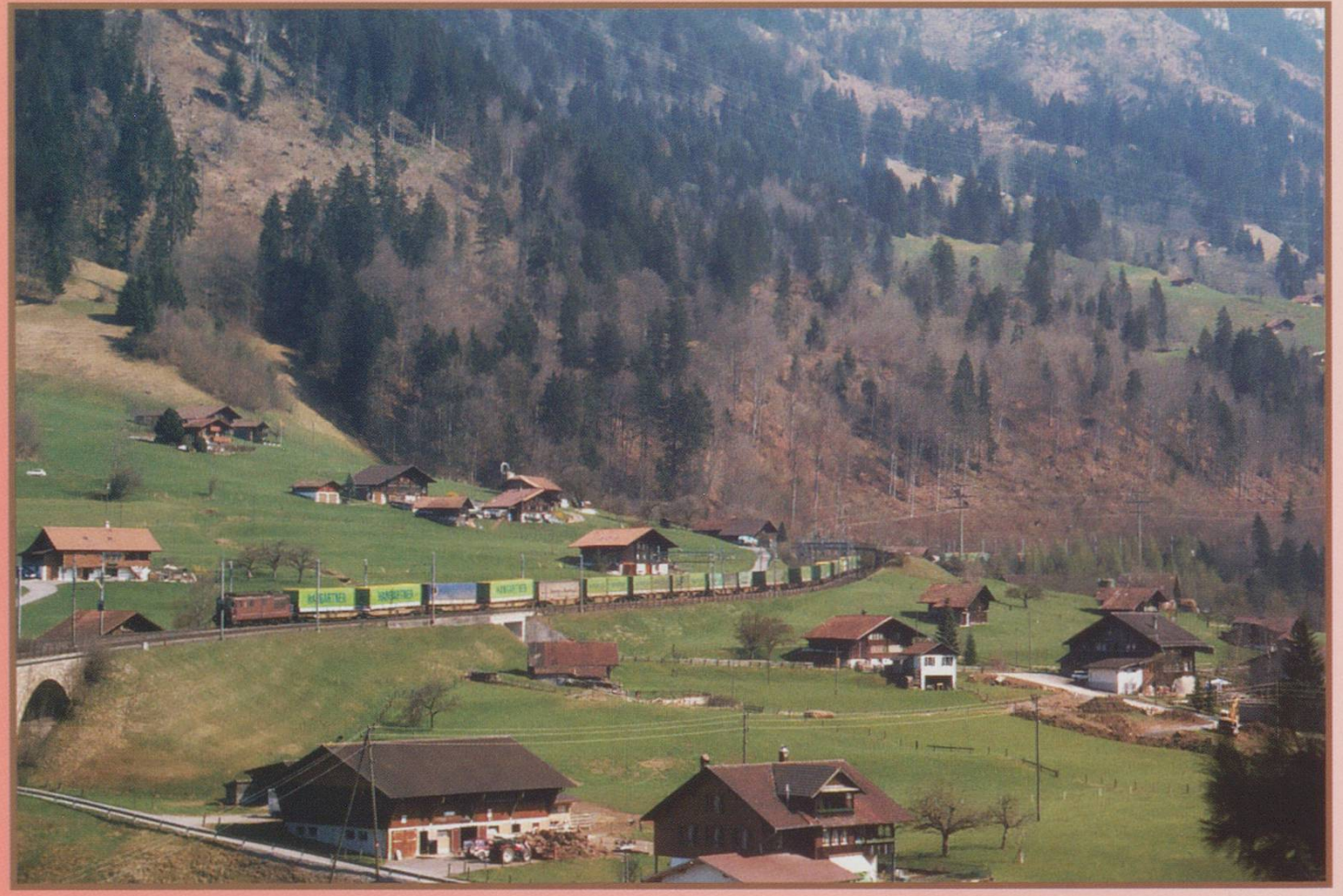
A BLS Re4/4 banking a heavy container train away from the camera uphill towards Kandersteg. The train locos (2 BLS Re465s) are hidden round the bend). Schloss Tellenburg, April 2003

Although the BLS 'main line' is no longer a procession of traditional brown BLS locos, the hourly Bern – Neuchâtel express services are currently diagrammed for Re4/4 locos.