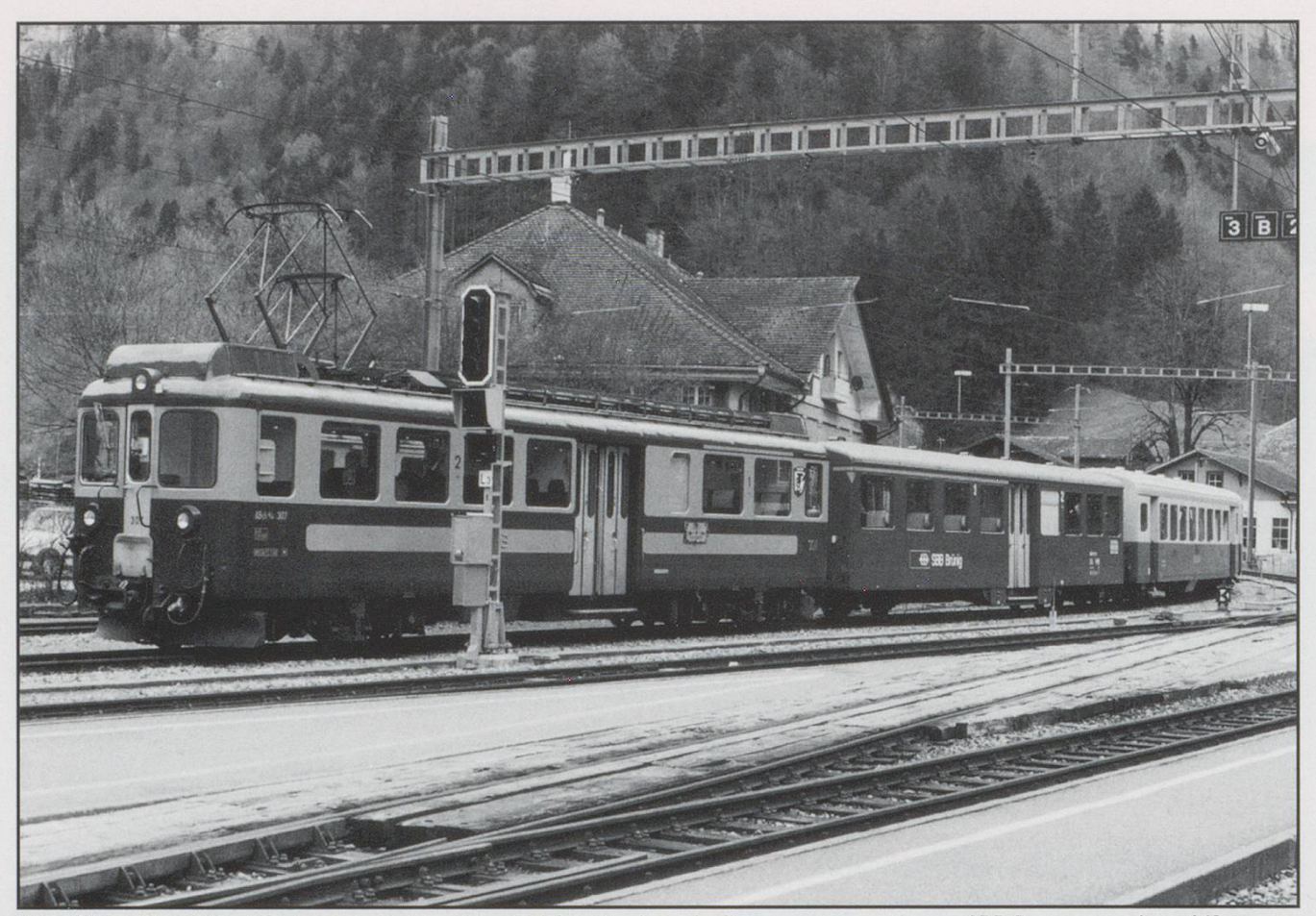
BOB 307 at Zweilütschinen preparing a rake of older stock, including a centre-entrance SBB Brunig coach and 'firstgeneration' modern coaches, to cope with the mid-day peak traffic flow. This was just a few days before more modern accident-victim stock was returned to the railway following rebuilding, so was a very timely photograph.

the 1986 built BDt driving trailers were parked out of use. When compared with what is now happening on SBB (ICN EMUs, intercity with Re460 at the back or in the middle), the BOB is almost more like loco haulage.