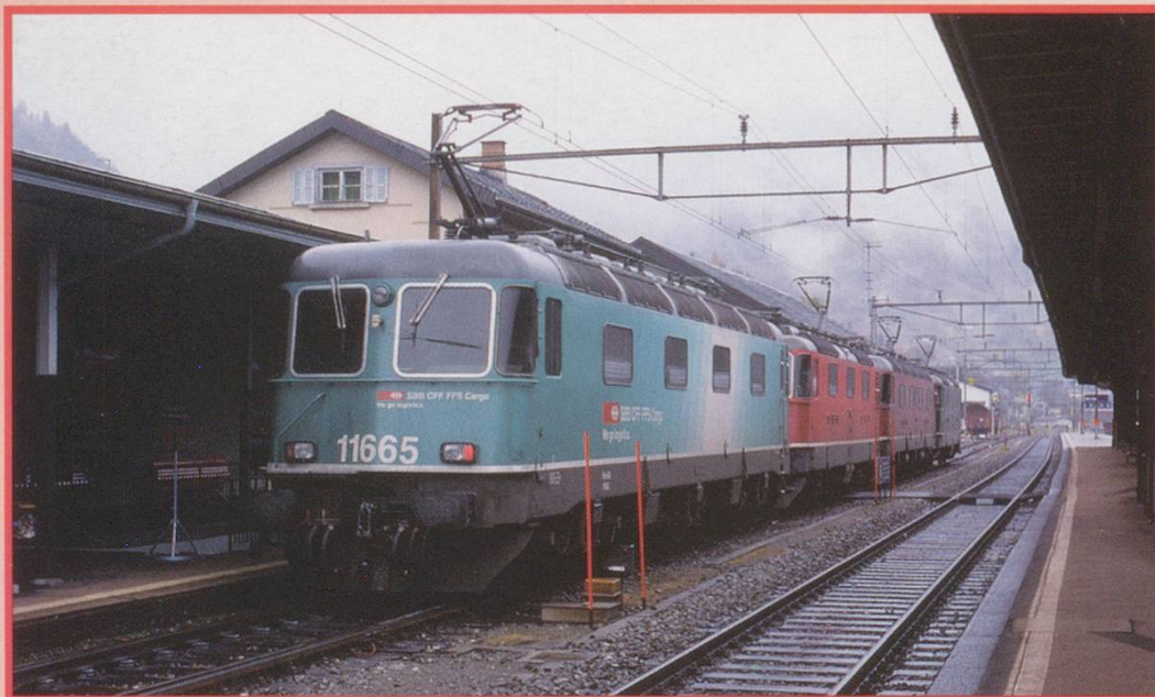
Re6/6 in SBB Cargo I livery at the head of a loco-positioning movement at Airolo station. 9/01/02.