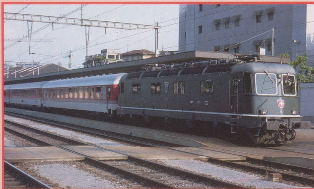
A Dortmund - Milano Eurocity at Chiasso. The Re6/6 will be replaced by an Italian E656 for the rest of the journey. 23/08/95.