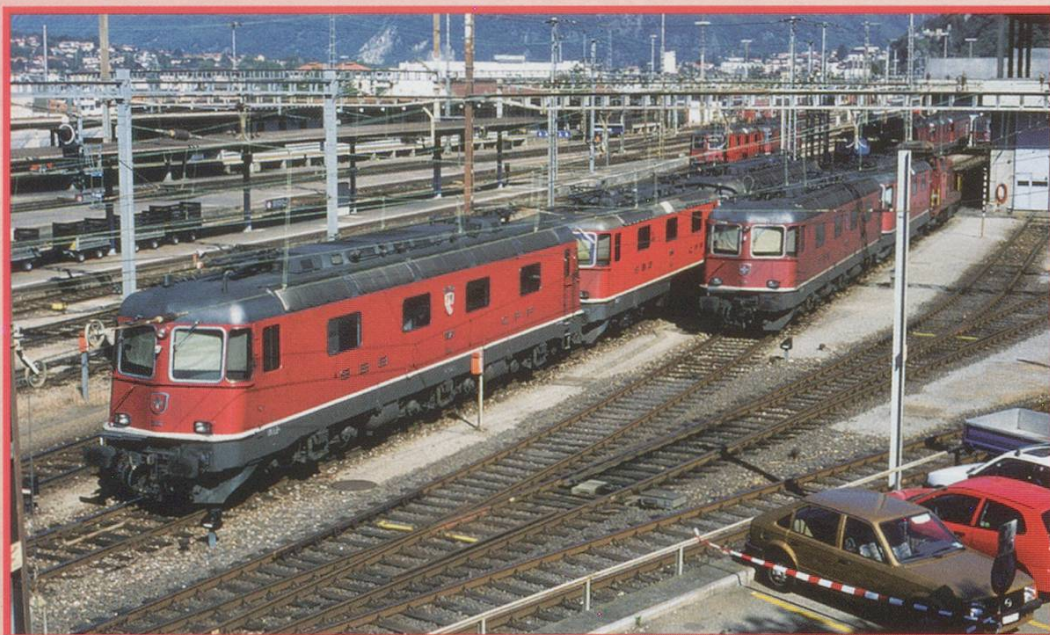
Re6/6s and Re4/4s at Bellinzona depot on 6/10/02.