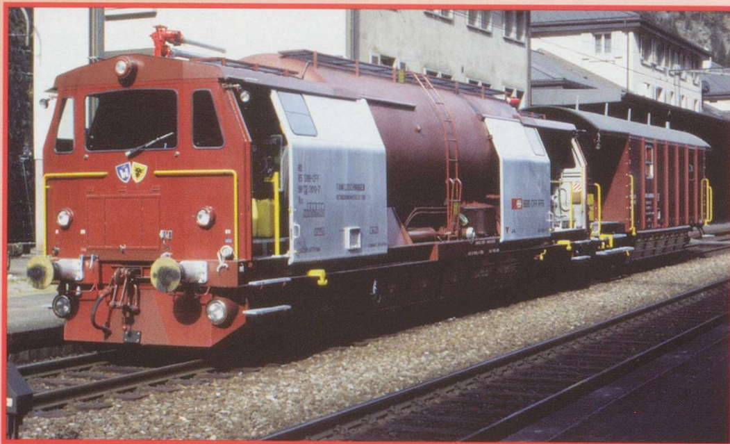
The Gotthard Tunnel rescue train stationed at Göschenen. 2/11/95.