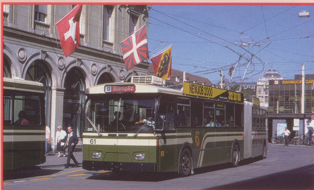
The proper SVB livery! Articulated trolleybus number 61, another without manufacturers badge, departs from opposite the HBhf in September 1977.