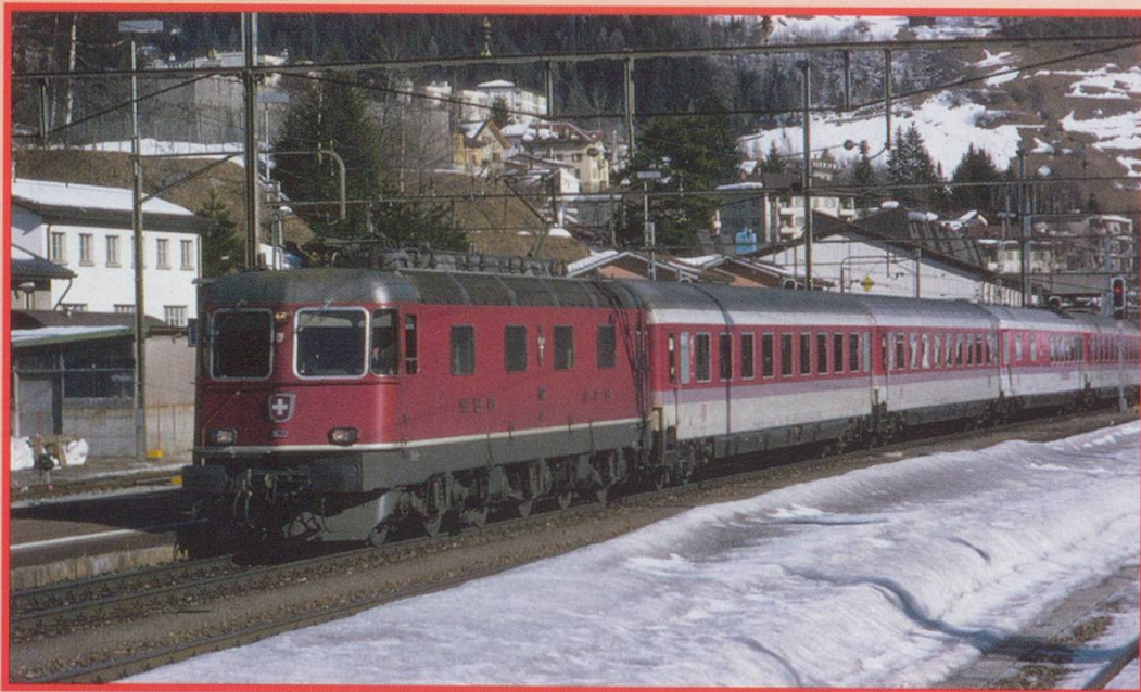
Wassen station on the middle level. 3/11/95.