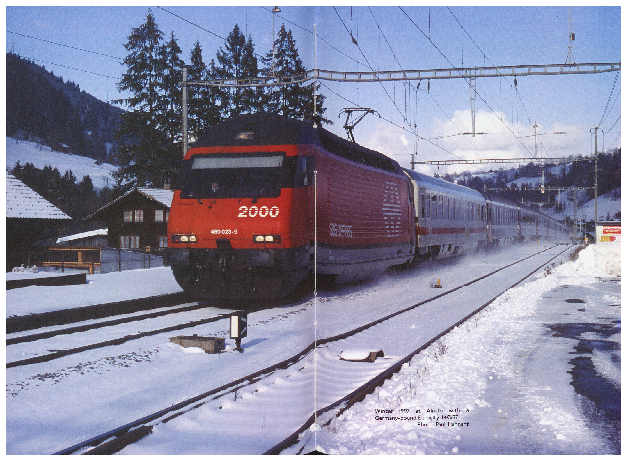
Winter 1997 at Airolo with a Germany-bound Eurocity 14/3/97.