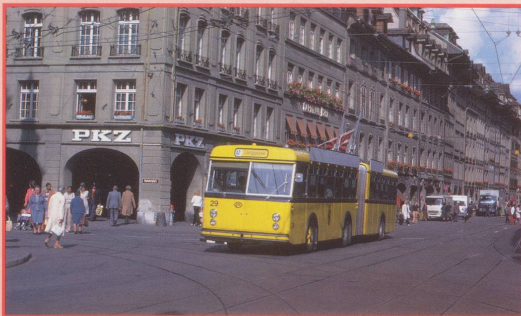
Bern. August 1978. Trolleybus no 29 of SVB, who appeared to have one or two vehicles painted in this yellow livery at a time when some municipal operators, including Bern, were changing to an orange scheme. Fortunately the orange livery did not last in Bern.