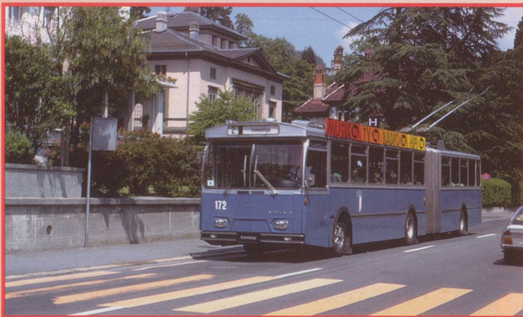
Luzern number 172, an articulated Volvo enters the city past the Kursaal heading for Emmenbrücke. June 1977.