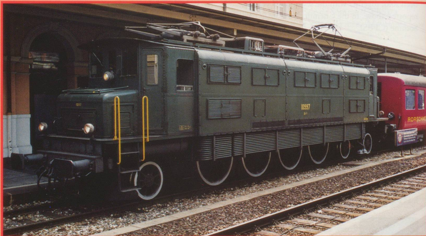
Privately owned and preserved ex SBB Ae 4/7 10997 with two Rorschach-Heiden coaches on a special. 10997 ran round the coaches and departed south towards Lugano. See the advert on page 23 about this loco.

The cars stored in the open alongside the main line have suffered badly from graffiti. There were small publicity pamphlets in black & white advertising SEFT services in the booking hall at Lugano station (I didn't pick one up!) where incidentally on the same morning I saw a special standard gauge train of two Rorschach-Heiden bogie coaches hauled by an Ae4/7.