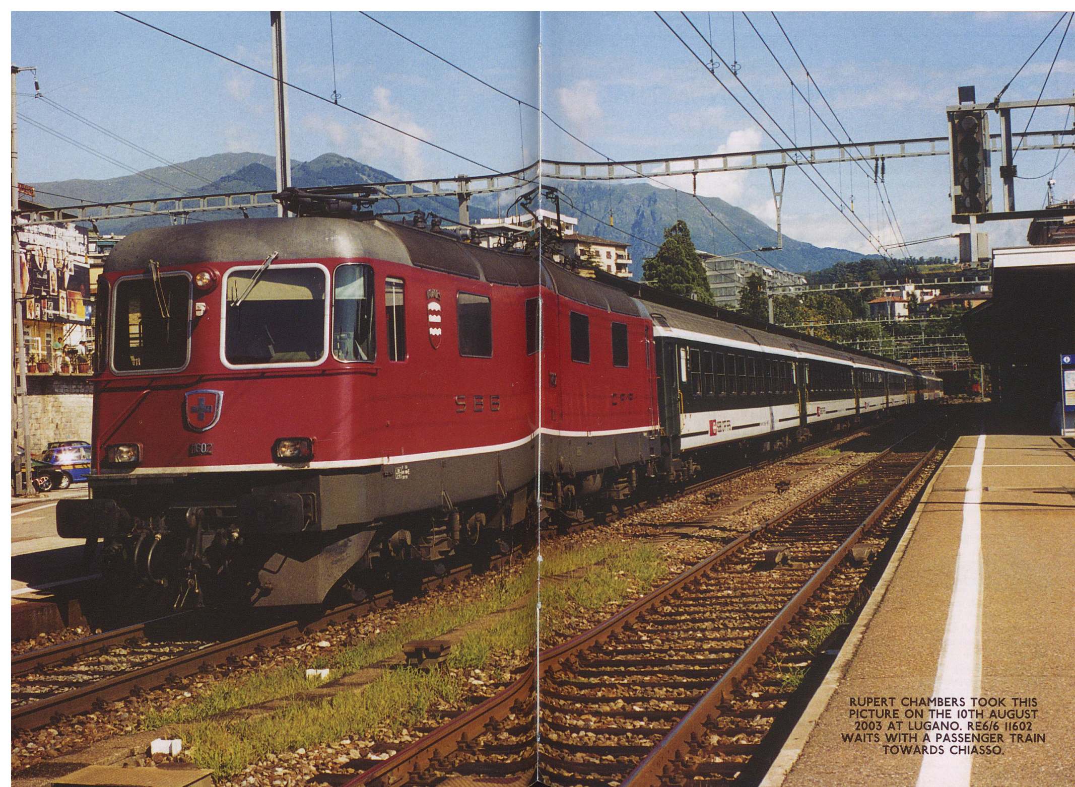
RUPERT CHAMBERS TOOK THIS PICTURE ON THE 10TH AUGUST 2003 AT LUGANO. RE6/6 11602 WAITS WITH A PASSENGER TRAIN TOWARDS CHIASSO.