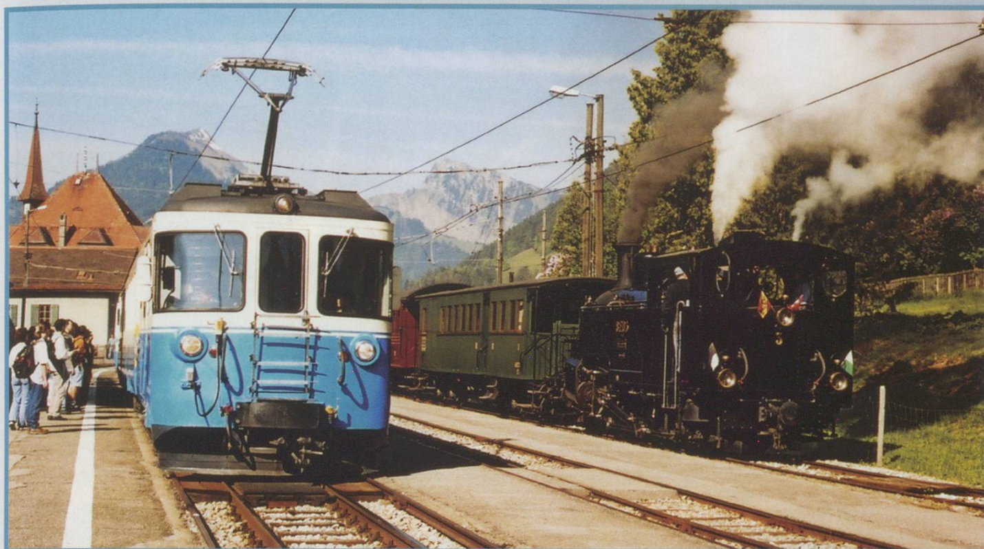
The Blonay-Chamby Museum's BFO3 all steamed up at Château d'Oex on 29.05.04. An MOB 4000 series railcar is on the left.

The Montreux–Oberland-Bernois (MOB) railway was opened in sections. Château-d'Oex and Gstaad were reached in 1904 and the MOB (now known as Golden Pass Services) planned a major event for 29 th May 2004 to celebrate the opening of the Montbovon to Gstaad section. The event featured station open days and events at Château-d'Oex, Rougemont, Saanen and Gstaad, the unveiling of "new" stock at 3 stations, a steam train from the Blonay-Chamby museum and finally a grand parade featuring 20 trains and based on Rougemont. Special catering was provided with visiting restaurant cars from the GFM (Rougemont) and Blonay-Chamby (Saanen). Rougemont was also to feature untold quantities of "Travellers Rosti" amongst many culinary delights.