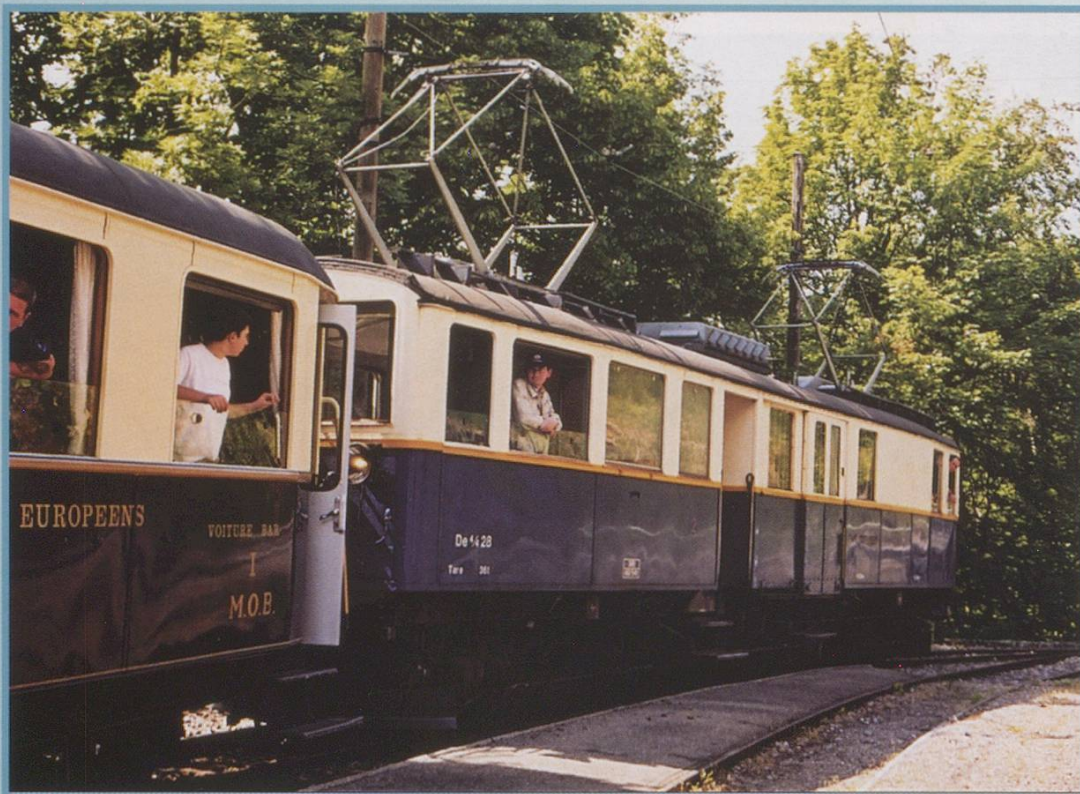
MOB/BC De4/4 28 at Chamby on the return journey from Montreux. 30.05.04.

meet my wife and so I was delighted to have the opportunity of trying the new railcar. It had that inescapable wonderful aroma that only new vehicles have and was very comfortable. Subsequently we returned to Rougemont for another helping of rosti whilst being entertained by a jazz band. Don't the Swiss do these things well? The newly unveiled school children's carriage, B208, was on view and like a number of the decorated locos is different on each side.