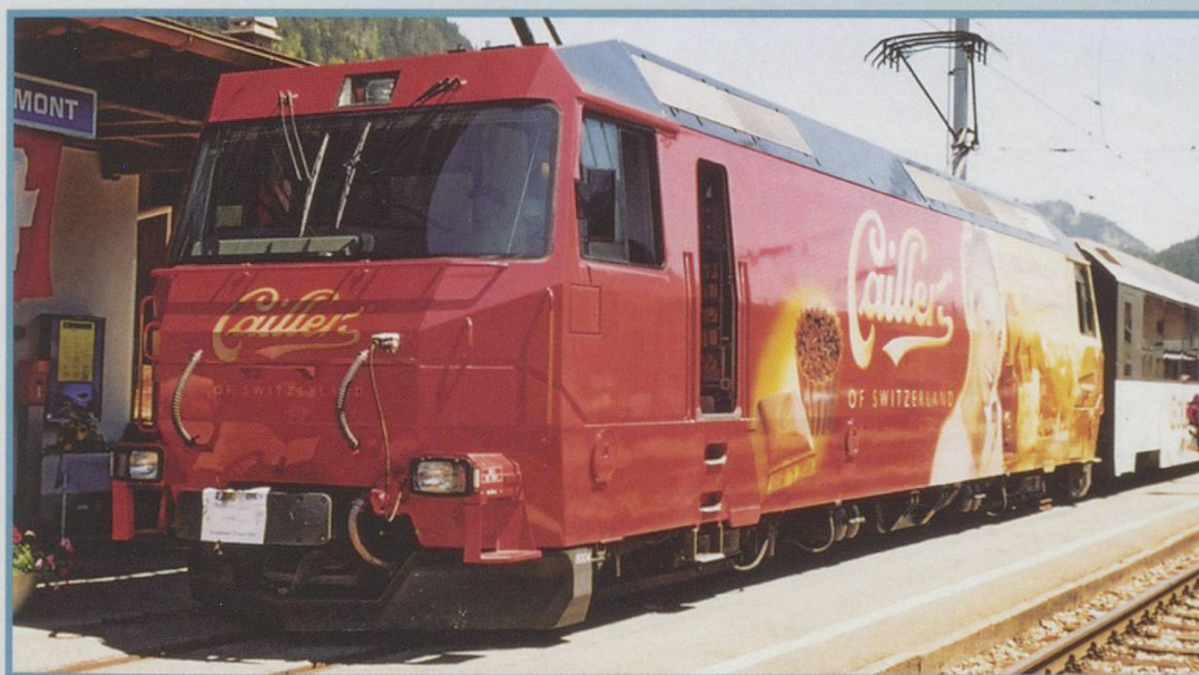
Golden Pass Services Ge4/4 8004 in the Cailler livery. Rougemont. 29.05.04.

The parade was due to get underway at 13.30 and was to feature a number of special