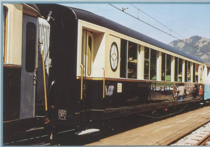
The "new" Pullman As103 at Gstaad. 29.05.04

Remember. All this was taking place during normal operations and indeed free travel was available between Rossinière and Saanenmöser so trains were busy. Shortly after the arrival of the steam train the VIP party arrived in the Pullman train from Château-d'Oex and the new Be4/12 set appeared from Zweisimmen to be formally inaugurated with a series of speeches and a small buffet.