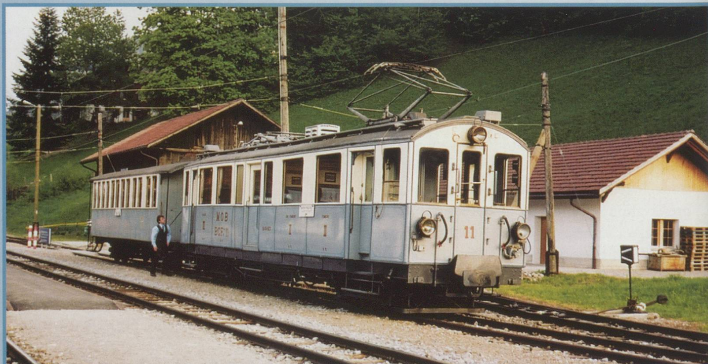
MOB/BC no.11 waits at Gstaad in the evening of 29.05.04.

motorcars 3005/6 (the latter in a new dark blue livery) and rail car sets 3001/3301 and 5001. The parade featured railcars 1002/3 which arrived from Rougemont. Originally bought second-hand for local services around Montreux these are now used for schools services around Chateau-d'Oex and Gstaad. 36 then