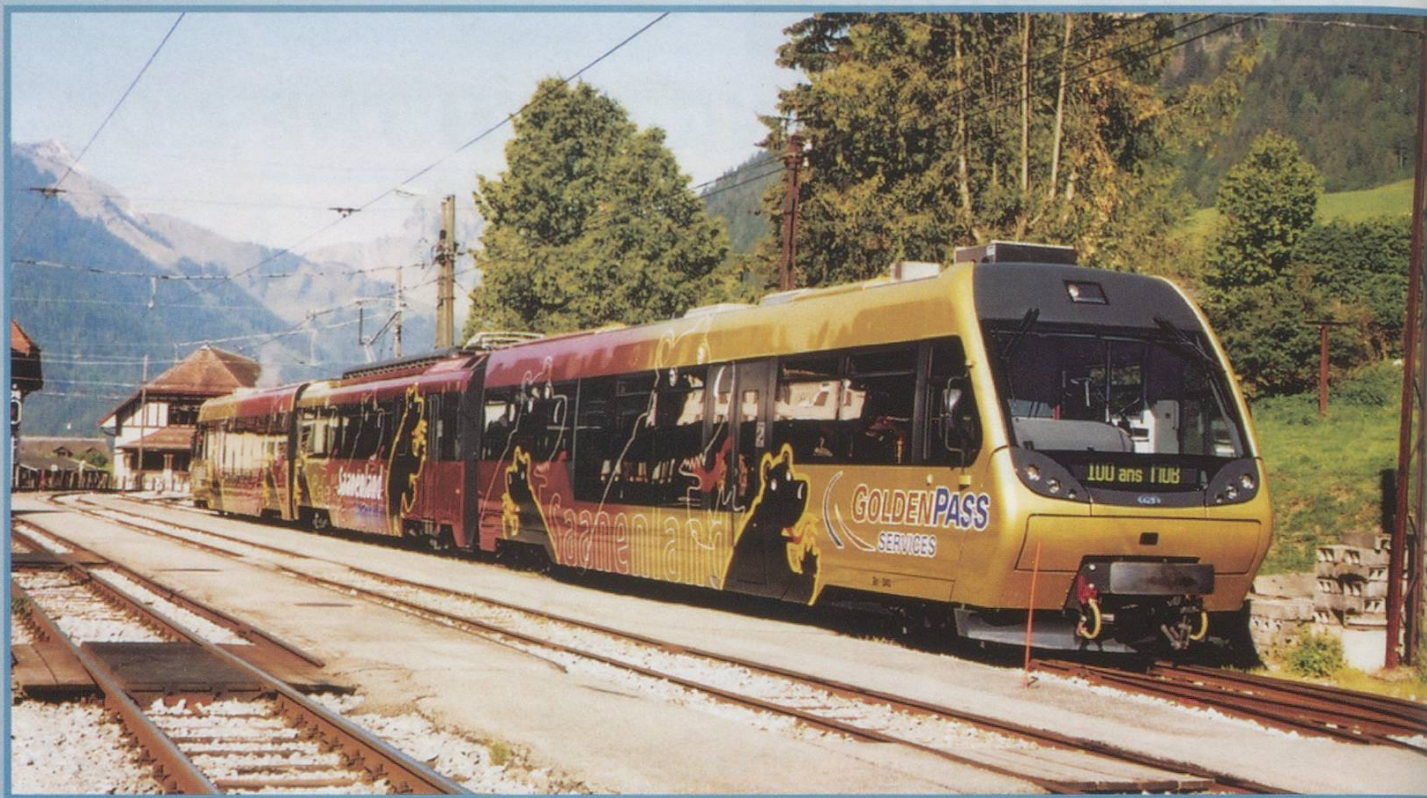
Golden Pass Services-MOB Be4/12 5003 at Château d'Oex. 29.05.04. Low floor entrances and designed to improve local services in and around Zweisimmen, Gstaad and Saanen.