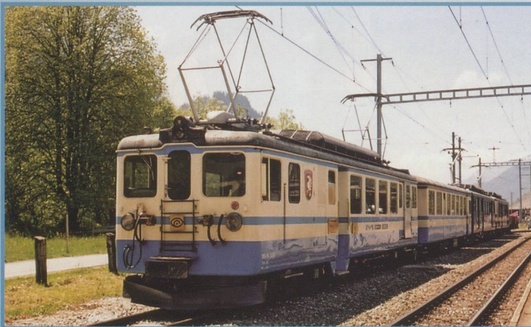
MOB Be4/4 3001 and trailer with 3006 and 3005 at Saanen. 29.05.04.

workings (primarily the trains on display at the various stations) slotted in between the normal service trains on this single-track route. The parade would therefore cover virtually all the type of stock operated on the line. I headed for Saanen to photograph the various workings from there.