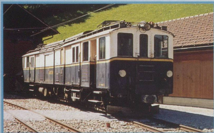
MOB DZe 6/6 2002 outside Gstaad shed. 29.05.04.

million is required and that the railway is hoping for and actively looking for sponsorship. DZe6/6 2002 has been hidden in the Gstaad shed for many years and so it was pleasing to see it out in the open at last. Suspect wheelsets prevented it appearing in the parade.