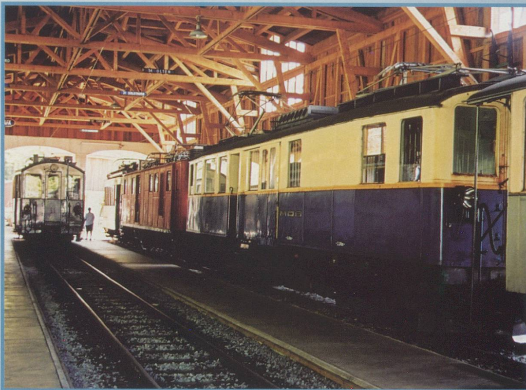
MOB/BC II and De4/4 28 in the Blonay-Chamby Museum. 30.05.04.

There was plenty of shunting around in the depot and this brought railcars 11 and 28 side by side for a while. My grasp of the various announcements about trains wasn't too good but it seemed that De4/4 28 and its Pullman were setting off again so we took our places. This time we set off to Chamby and then continued