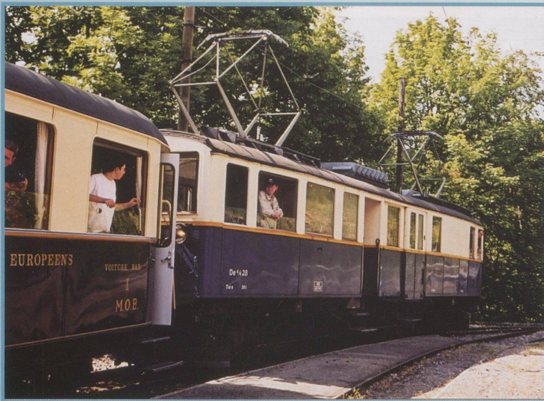
MOB/BC De4/4 28 at Chamby on the return journey from Montreux. 30.05.04.

meet my wife and so I was delighted to have the opportunity of trying the new railcar. It had that inescapable wonderful aroma that only new vehicles have and was very comfortable. Subsequently we returned to Rougemont for another helping of rosti whilst being entertained by a jazz band. Don't the Swiss do these things well? The newly unveiled school children's carriage, B208, was on view and like a number of the decorated locos is different on each side.